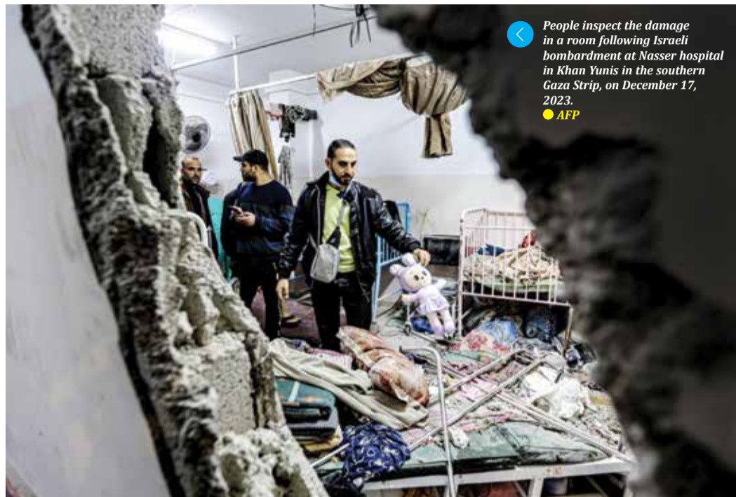
People inspect the damage in a room following Israeli bombardment at Nasser hospital in Khan Yunis in the southern Gaza Strip, on December 17, 2023.

The air and ground war, launched in response to Hamas' October 7 attack on Israel, has killed nearly 20,000 Palestinians, displaced