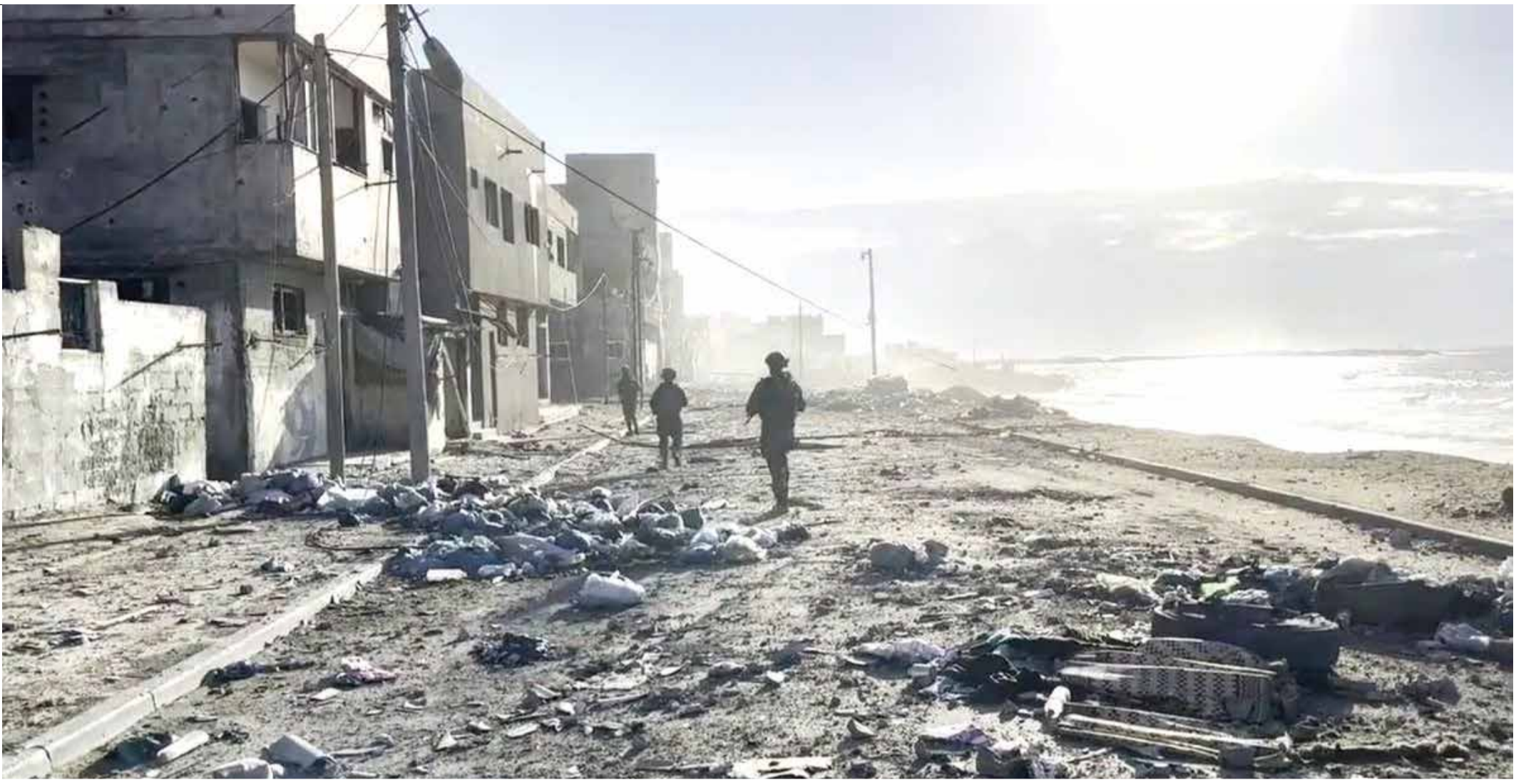
↑ Israeli soldiers operate, amid the ongoing ground invasion in a location given as the Gaza Strip in this screengrab obtained from a video released on November 17, 2023.