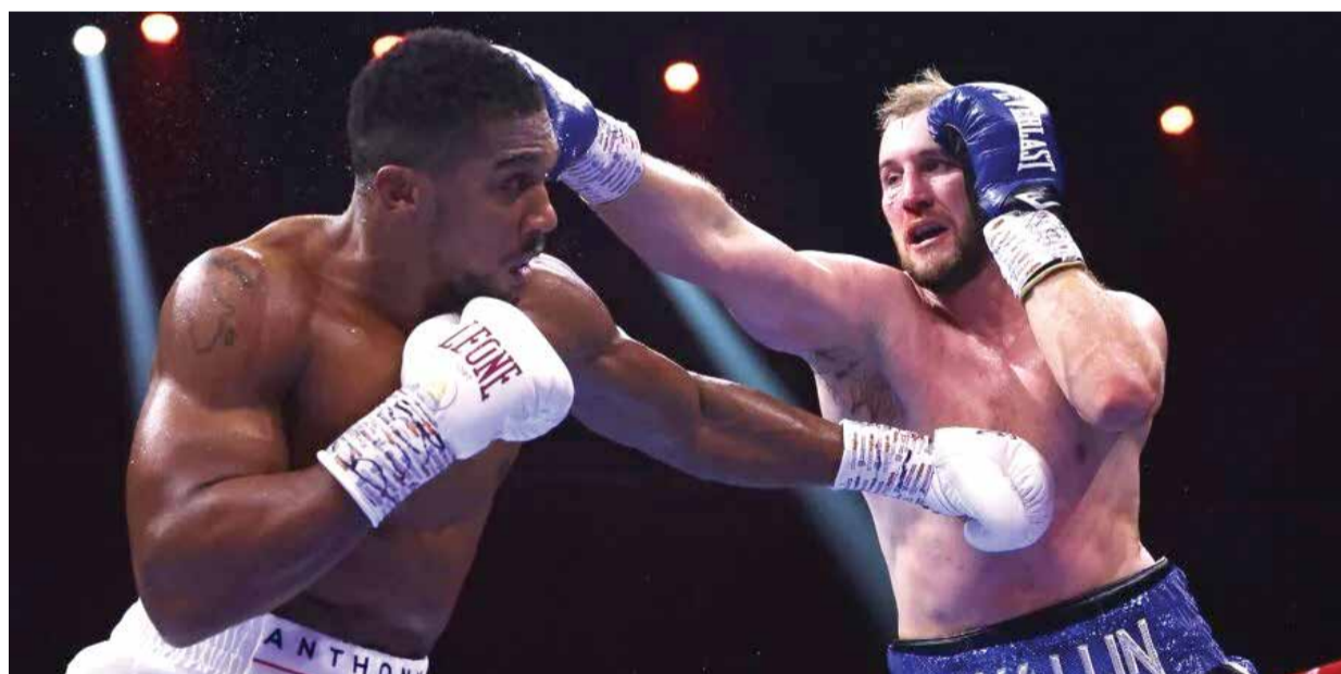
Anthony Joshua (L) and Otto Wallin exchange punches during a heavyweight fight in Riyadh, Saudi Arabia, on December 23, 2023.

Earlier in the night, American Wilder appeared a shadow of himself in Riyadh, and was hurt badly in the eighth as New Zealander Parker was awarded a unanimous decision.