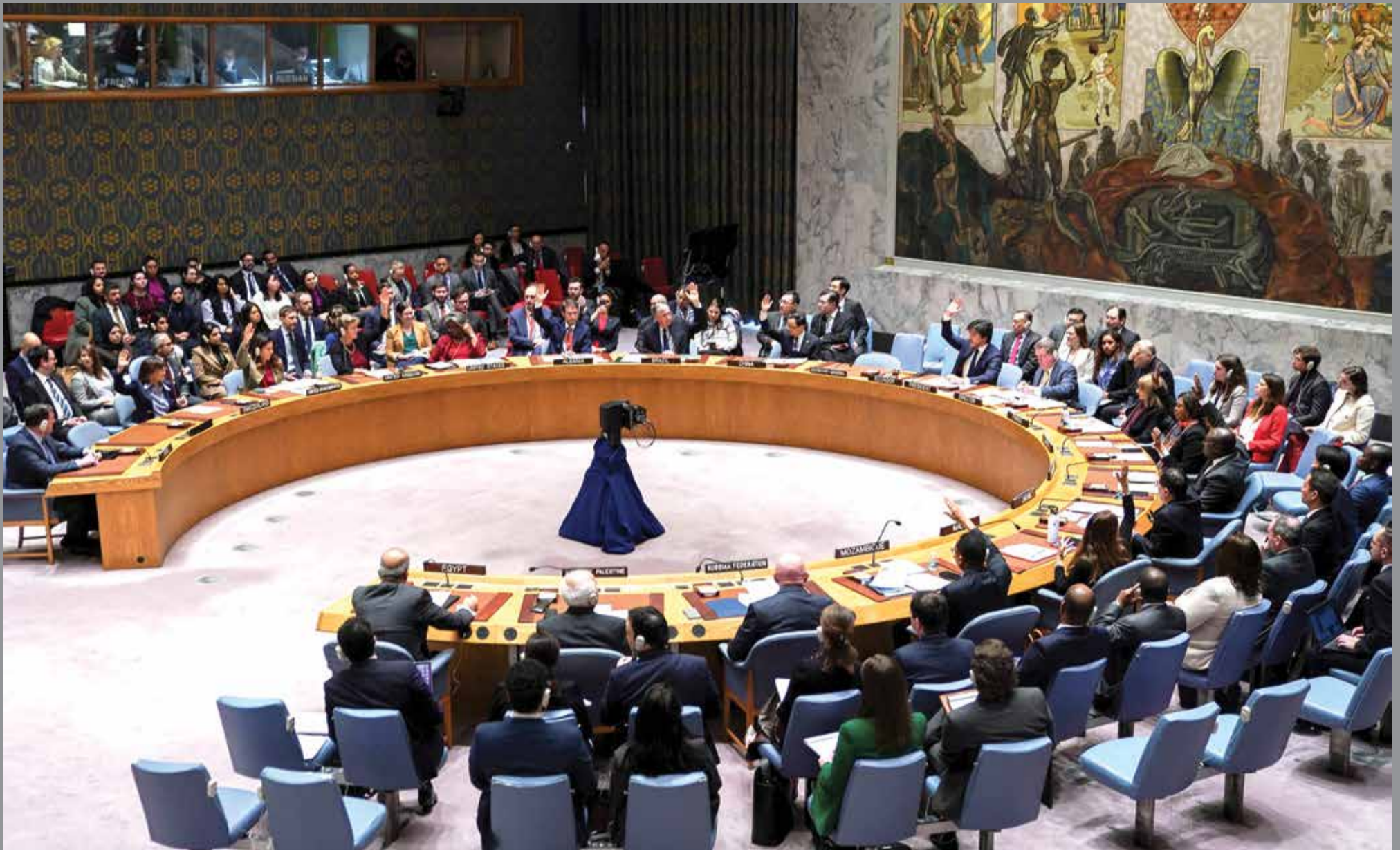
Members of the United Nations Security Council vote on a proposal to demand that Israel allow aid access to the Gaza Strip - via land, sea and air routes - and set up UN monitoring of the humanitarian assistance delivered, during a meeting at the UN headquarters in New York, US, on December 22, 2023.