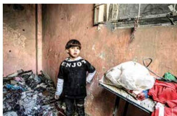
A child stands amid the rubble in a room overlooking a building destroyed by a strike in Rafah in the southern Gaza Strip on December 24, 2023.