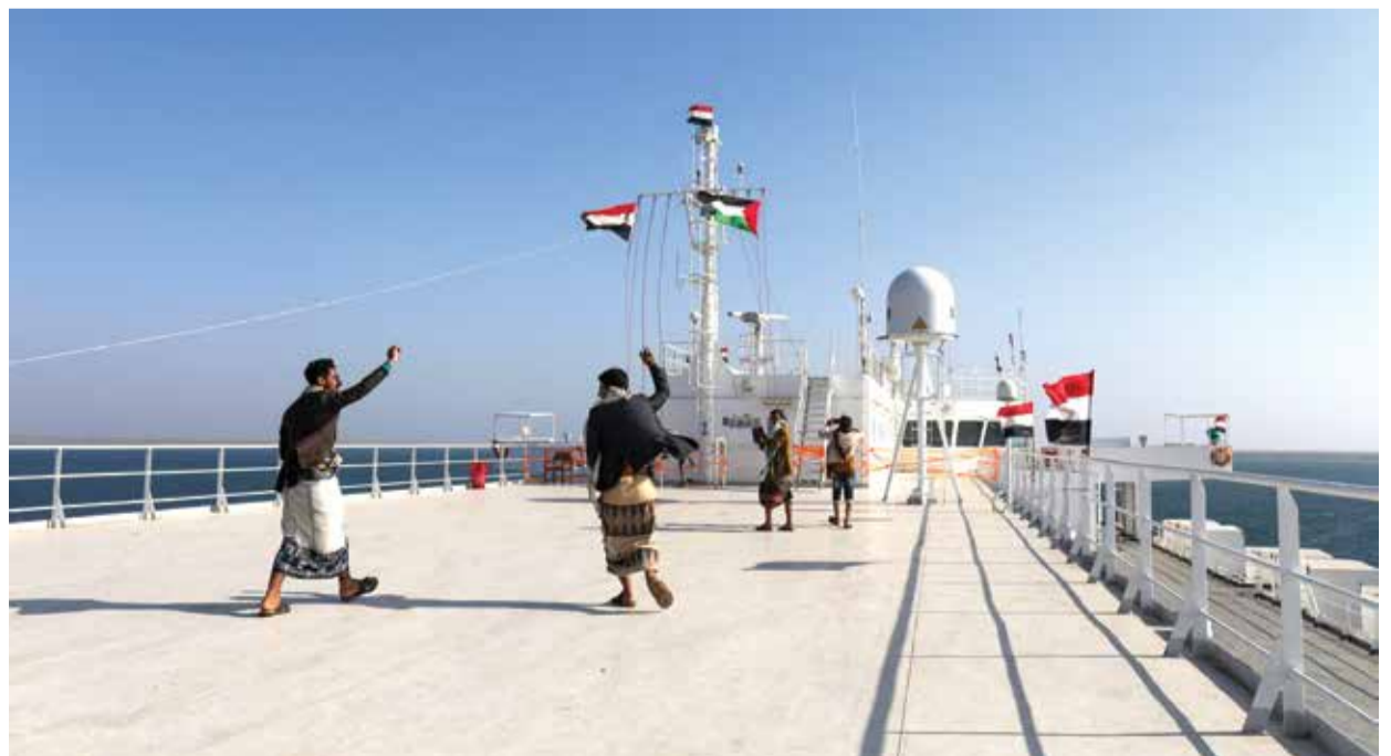
People dance on the deck of the Galaxy Leader commercial ship, seized by Yemen's Houthis last month, off the coast of al-Salif, Yemen, on December 5, 2023.

However, it seems unlikely that the establishment of such a coalition will stop Yemen's actions against Israel. The Yemenis have successfully resisted the Saudi-led coalition for eight years and will not easily capitulate to American pressure. It is noteworthy that Saudi Arabia is not among the countries announced to be part of the maritime alliance. For now, Riyadh has chosen a policy of neither war nor peace toward Yemen.