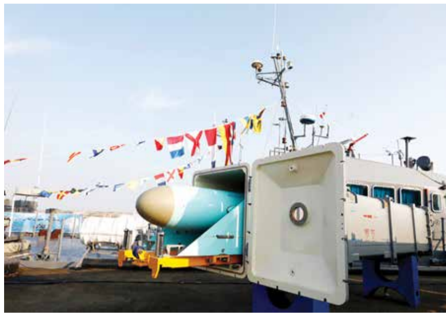
Nasir cruise missile system is put on display during a ceremony in Iran's southeastern port city of Konarak on December 24, 2023.

flight and choose a new target before striking and destroying it. Nasir cruise missile, with a range of more than 100 kilometers, offers a high destructive force against enemy targets, and can be mounted on rocket launching vessels of different classes, the commander stated. The Iranian Navy's new helicopters have been furnished with a range of electronic warfare systems, which can deceive various missiles. Moreover, the naval force's reconnaissance copters have Identification Friend or Foe (IFF) systems fitted in. The systems allow the aircraft to undertake both naval combat and civilian maritime missions.