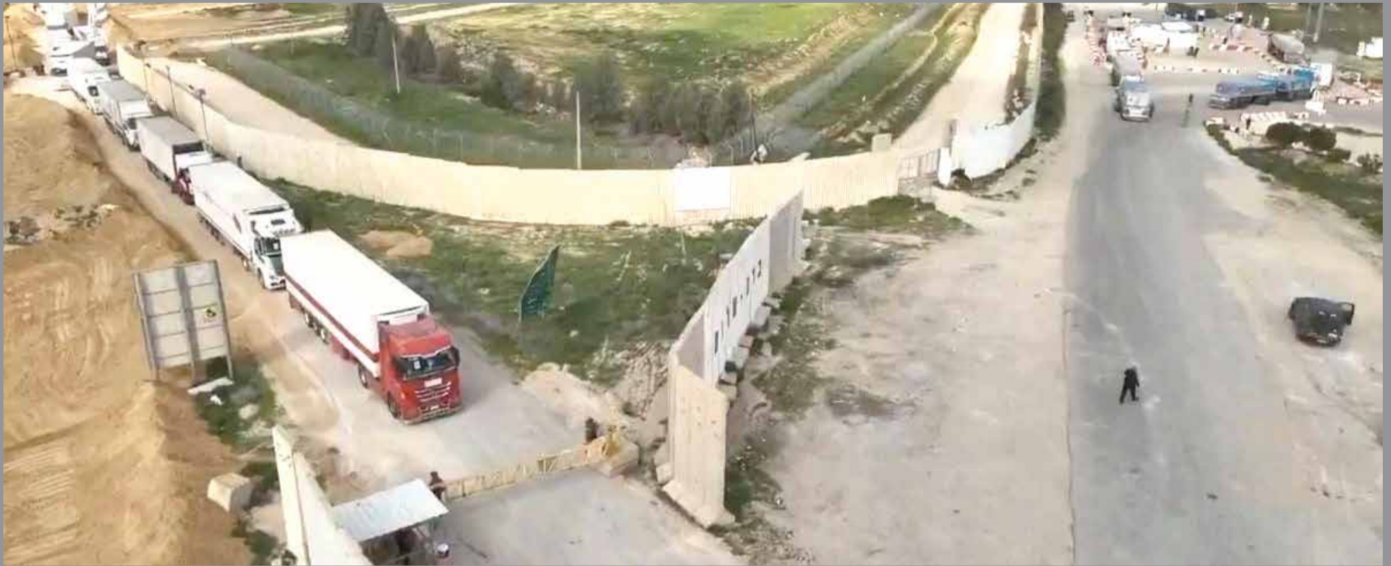
Humanitarian aid trucks wait in line to be inspected at the Kerem Shalom crossing, amid Israel's ongoing war against Gaza on December 12, 2023.