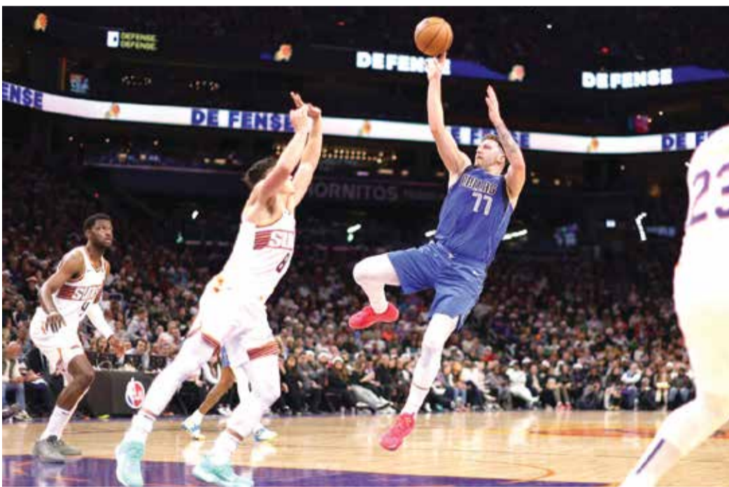
Mavericks' Luka Doncic (77) shoots during an NBA victory over the Suns at Footprint Center, Phoenix, AZ, US, on December 25, 2023.

"I'm feeling good," Doncic said postgame on ESPN. Then referencing the fact that Lively was just back in the lineup after an injury absence, he added, "We missed Lively for (four) games, we missed (Irving) I don't know how many games, so we are far away from our potential. ... But 'next-man-up' mentality, and I can't wait until (Irving) comes back."