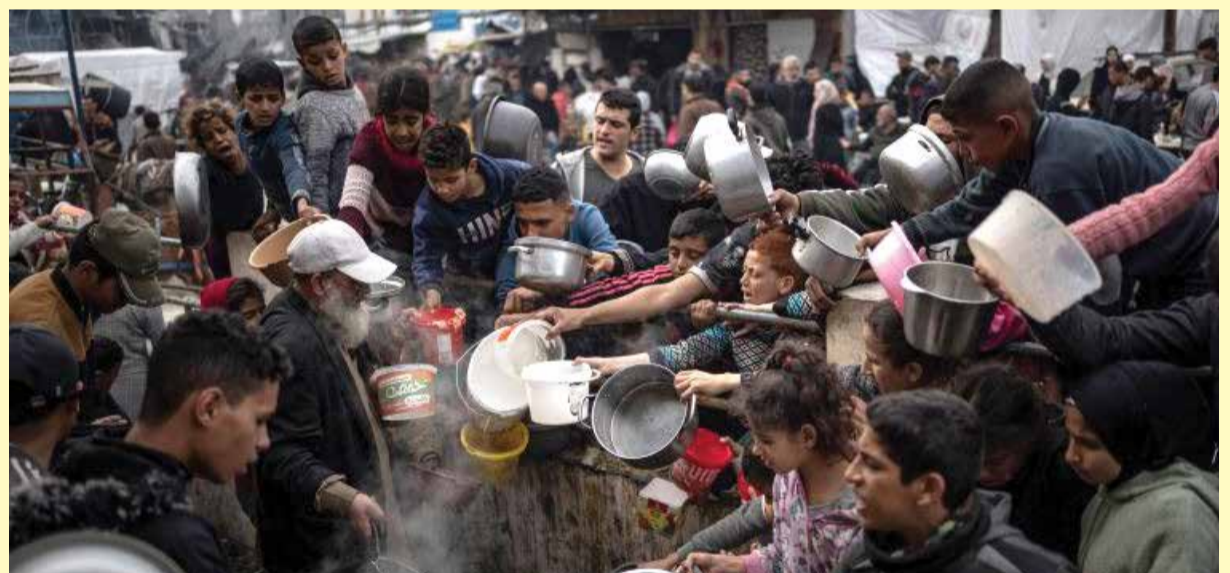
Hungry Palestinians rush with their pots to get some food provided by aid agencies in Rafah, the Gaza Strip.

Weeks of restricted access to food in the Gaza Strip have culminated in severe hunger and growing risks of famine in the besieged enclave. Since early October, Israeli attacks across Gaza have damaged local bakeries and food warehouses, along with roads that are used to transport humanitarian aid. Israel’s total blockade on the enclave has also restricted food, water, and fuel from entering in the first place. How bad is the starvation in Gaza, and what is the food supply like since the war? Here is Al Jazeera’s investigation of the situation.