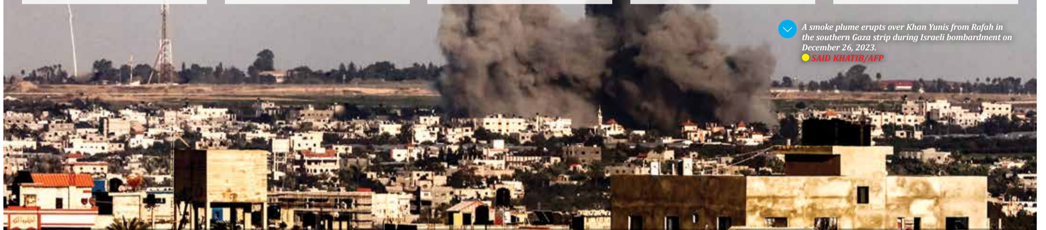
✓ A smoke plume erupts over Khan Younis from Rafah in the southern Gaza strip during Israeli bombardment on December 26, 2023.

AP and REUTERS contributed to this report.