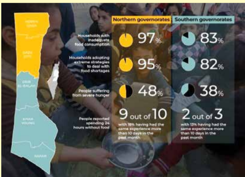
WORLD FOOD PROGRAMME

Burn solid waste or eat raw meat; That is the question