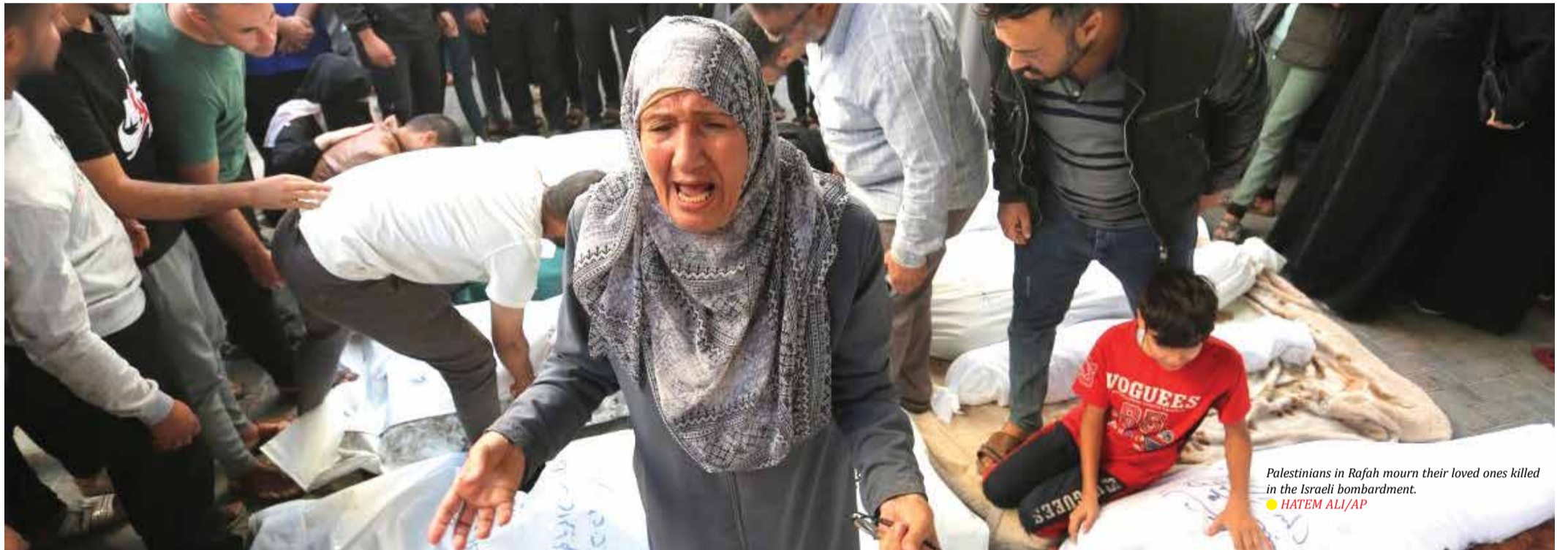
Palestinians in Rafah mourn their loved ones killed in the Israeli bombardment.

Betrayed at crossroads of history, forced to compare