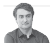
By Abed Akbari International affairs expert