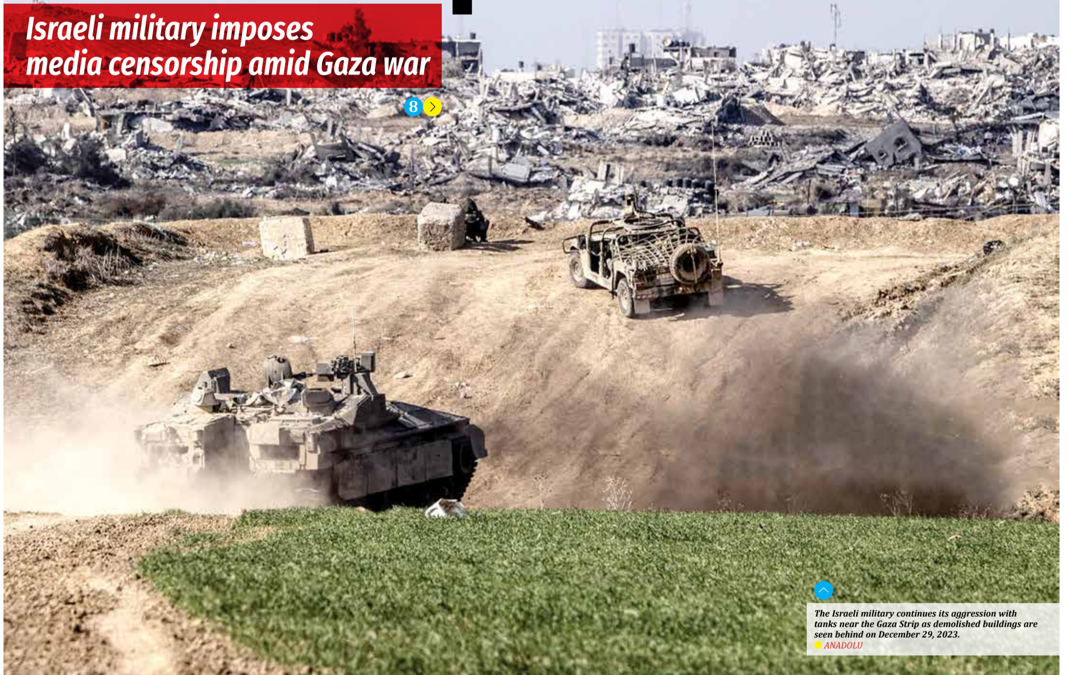
The Israeli military continues its aggression with tanks near the Gaza Strip as demolished buildings are seen behind on December 29, 2023.