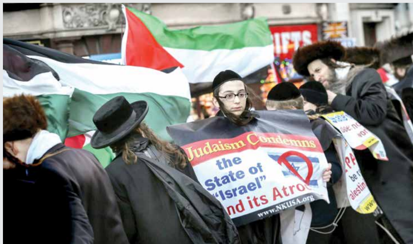
● Members of Neturei Karta, an anti-Zionist Jewish group, protest in London, UK, against ongoing Israeli violence in Gaza on December 9, 2023.

Zionists to achieve their unholy plans. However, it is hard to imagine what their subjects, the Jewish people of Israel, will get out of this deal. If moving to Israel was for religious reasons, Jewish scholars think that founding Israel was an act of rebellion against God. If moving to Israel was to be safe, they would have been much safer anywhere else in the world. What is more, they are committing genocide in Gaza as we speak. Was this what Israeli Jews signed up for?