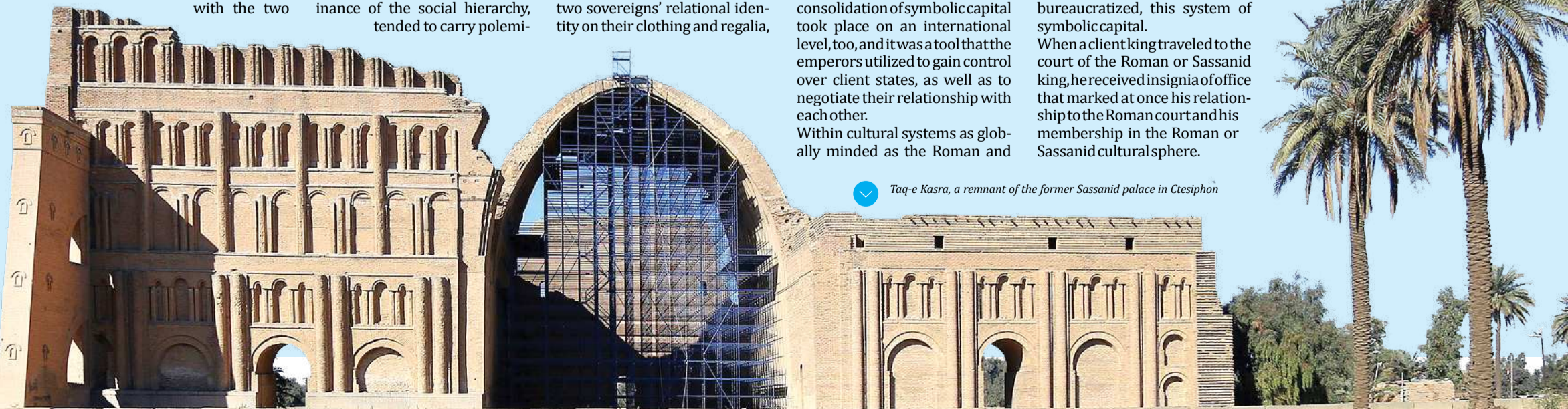
✓ Taq-e Kasra, a remnant of the former Sassanid palace in Ctesiphon