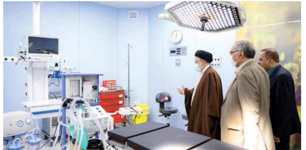
Hazrat-e Mahdi (PBUH) Smart Hospital was inaugurated in Tehran on October 12, 2023, with the presence of President Raisi (L) and Health Minister Einollahi (C).

Einollahi stated, "Idea generation and critical thinking are the two main components of a researcher. It is necessary to establish think tanks in research