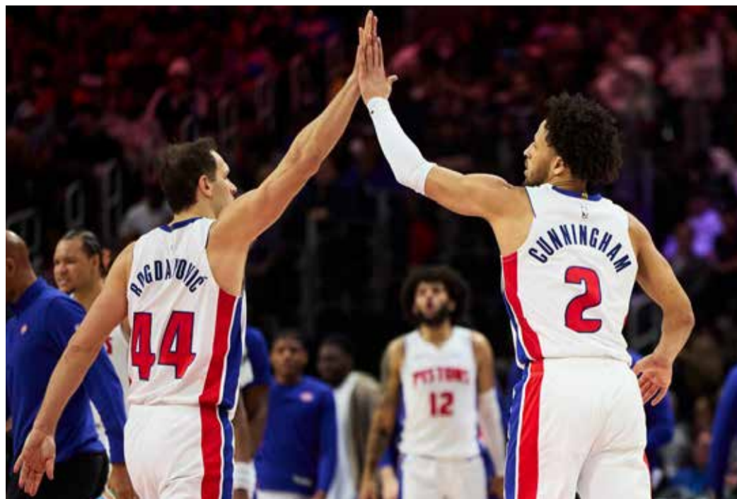
Pistons forward Bojan Bogdanovic and guard Cade Cunningham celebrates during an NBA victory over the Raptors at Little Caesars Arena, Detroit, MI, US, on December 30, 2023.

“We just kept battling,” said 2021 NBA draft number one pick Cunningham. “It’s been a long, long stretch – all these losses – but I’m just happy to be a part of a group of guys that don’t quit and bring it every day