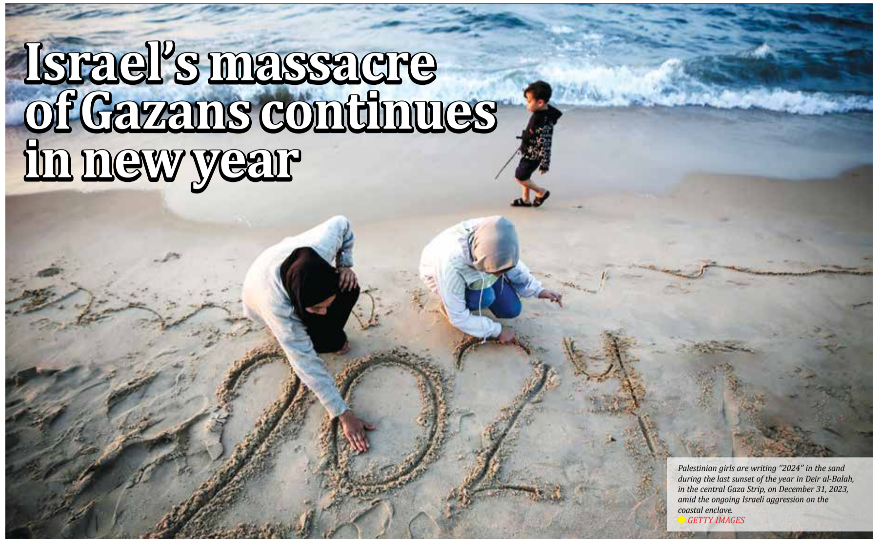
Palestinian girls are writing "2024" in the sand during the last sunset of the year in Deir al-Balah, in the central Gaza Strip, on December 31, 2023, amid the ongoing Israeli aggression on the coastal enclave.