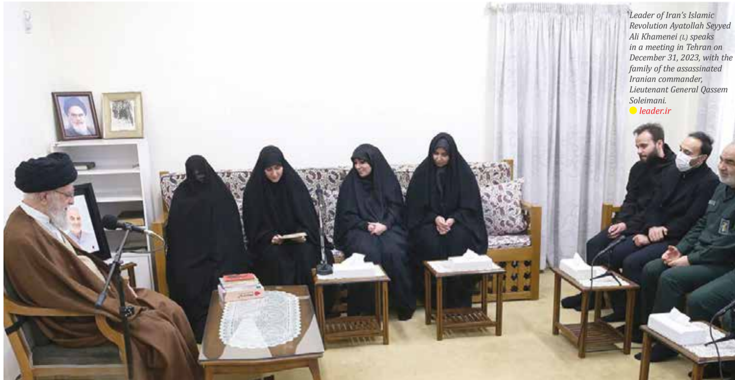
Leader of Iran's Islamic Revolution Ayatollah Seyyed Ali Khamenei (r.) speaks in a meeting in Tehran on December 31, 2023, with the family of the assassinated Iranian commander, Lieutenant General Qassem Soleimani.

Leader of Iran's Islamic Revolution Ayatollah Seyyed Ali Khamenei paid tribute to late Iranian commander Lt. Gen. Qassem Soleimani for reviving the resistance front in the region.