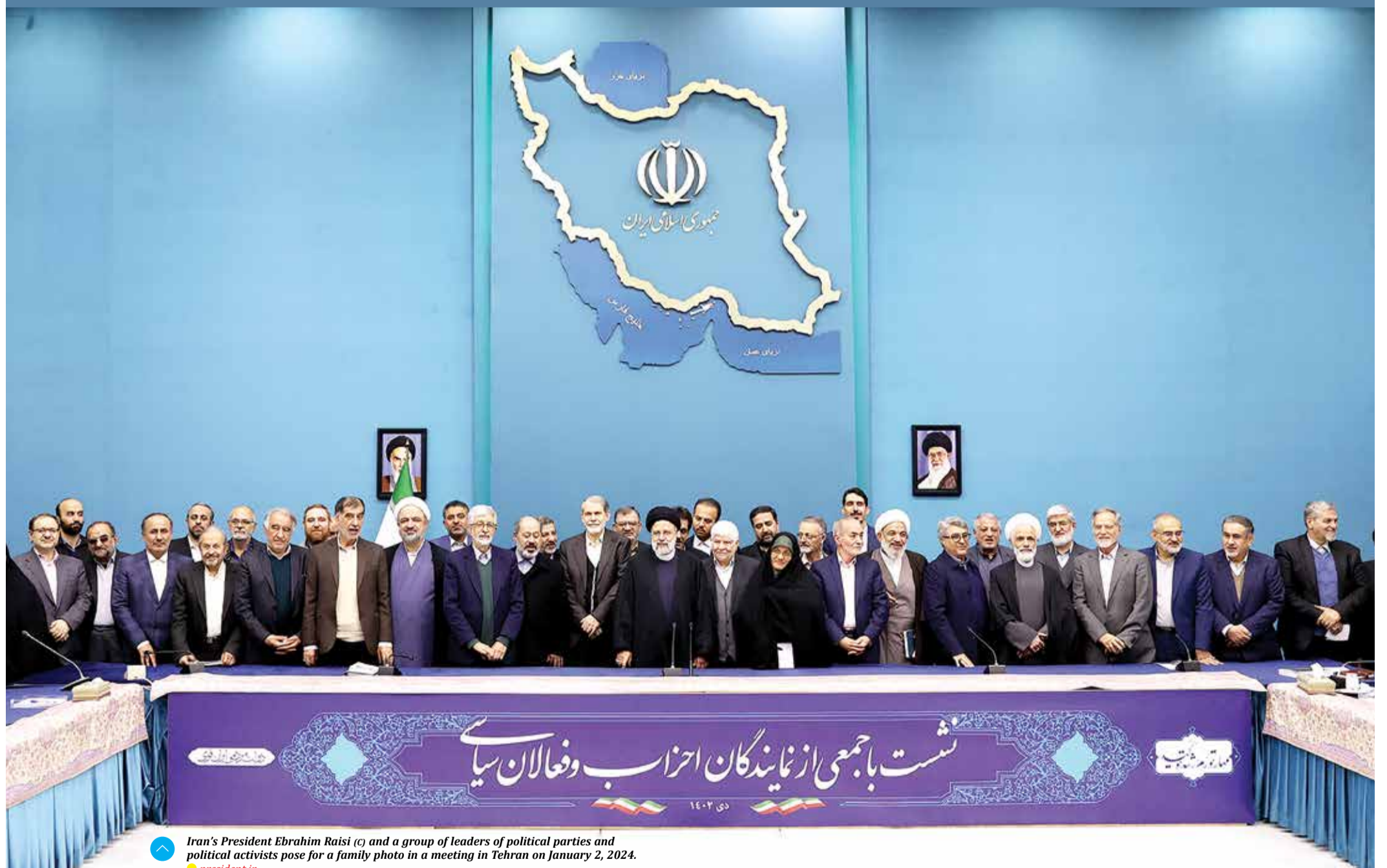
Iran's President Ebrahim Raisi (c) and a group of leaders of political parties and political activists pose for a family photo in a meeting in Tehran on January 2, 2024.

Narcissus flower cultivation in Mazandaran Province is opportunity for growth >