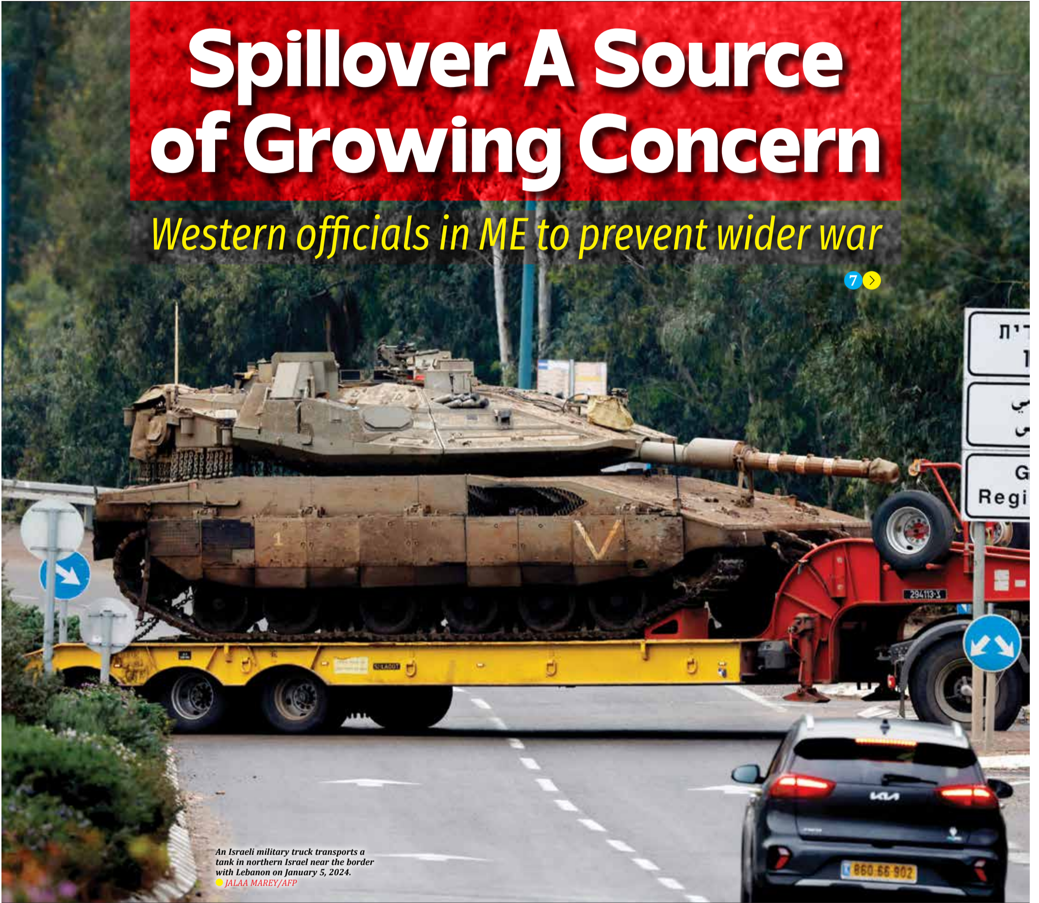
An Israeli military truck transports a tank in northern Israel near the border with Lebanon on January 5, 2024.