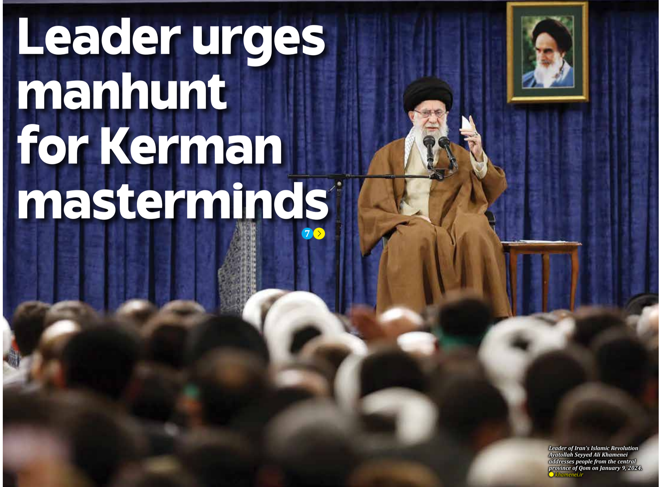
Leader of Iran's Islamic Revolution Ayatollah Seyyed Ali Khamenei addresses people from the central province of Qom on January 9, 2024.