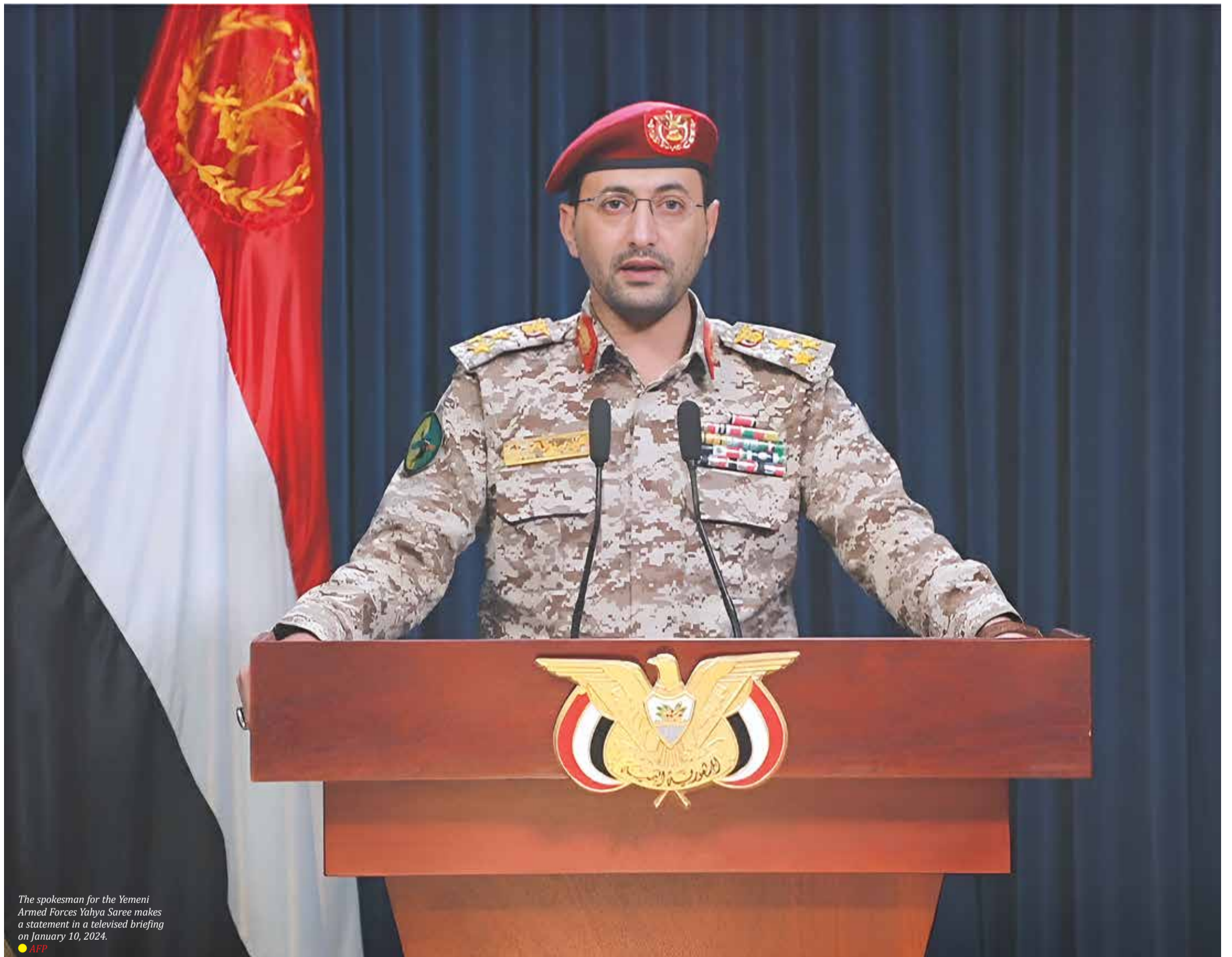
The spokesman for the Yemeni Armed Forces Yahya Saree makes a statement in a televised briefing on January 10, 2024.

Ansarallah launches largest attack in Red Sea 7 >