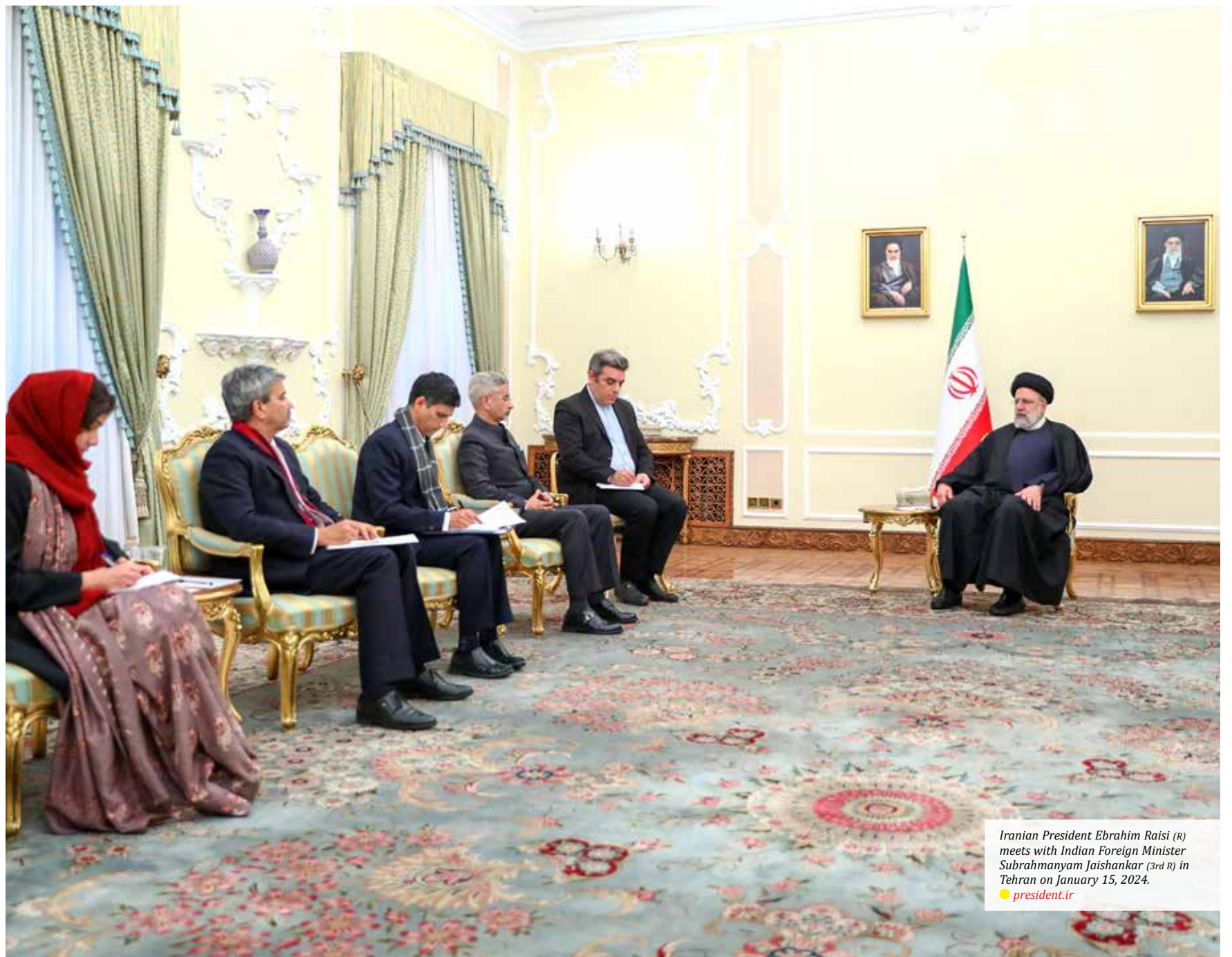
Iranian President Ebrahim Raisi (R) meets with Indian Foreign Minister Subrahmanyam Jaishankar (3rd R) in Tehran on January 15, 2024.