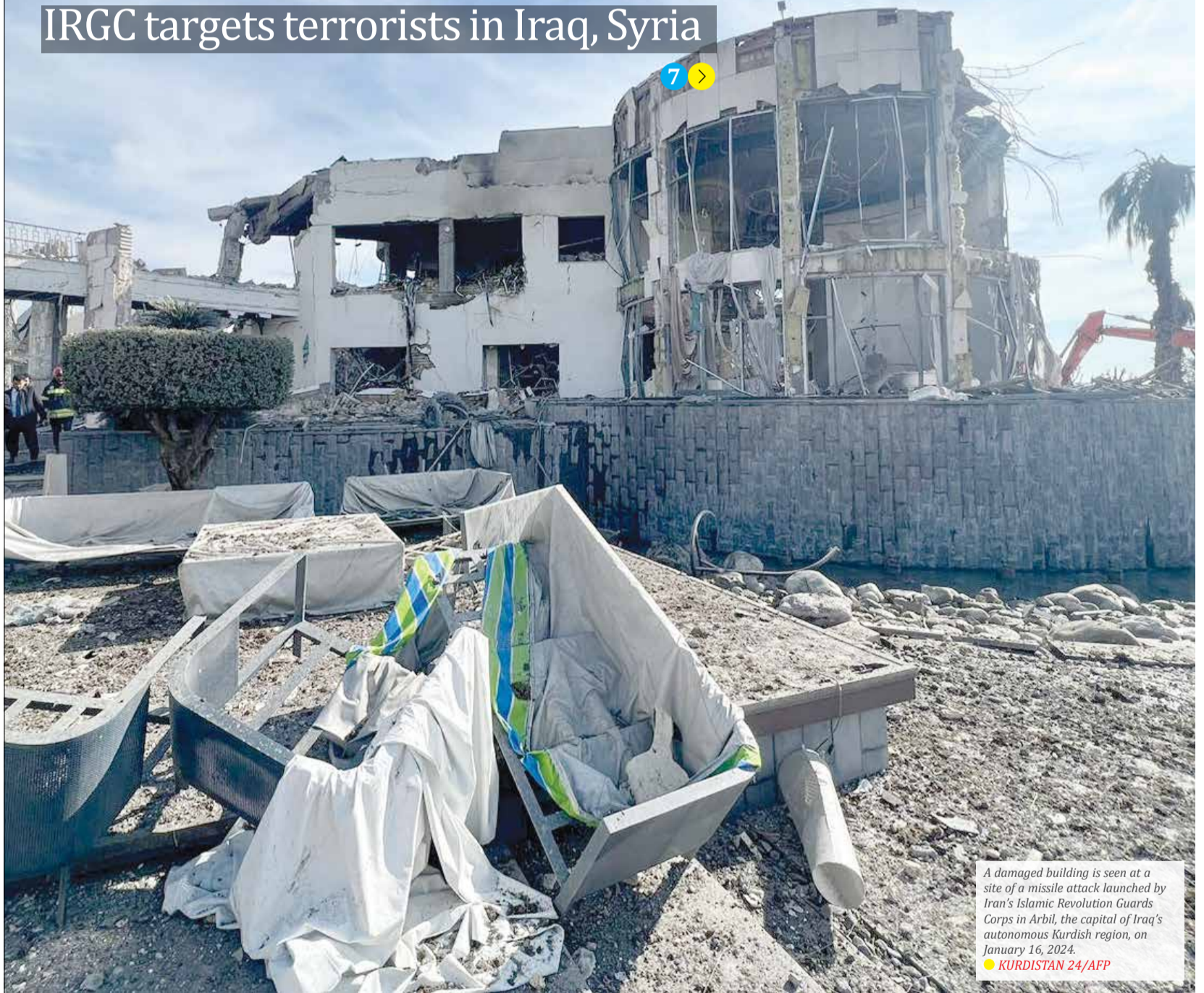
A damaged building is seen at a site of a missile attack launched by Iran's Islamic Revolution Guards Corps in Arbil, the capital of Iraq's autonomous Kurdish region, on January 16, 2024.