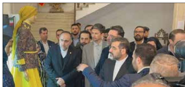
Iran's Minister of Culture and Islamic Guidance Mohammad-Mehdi Esmaeili emphasized the cultural significance of clothing during his visit to the 12th Fajr Fashion and Clothing Festival on January, 19, 2024. 8 >