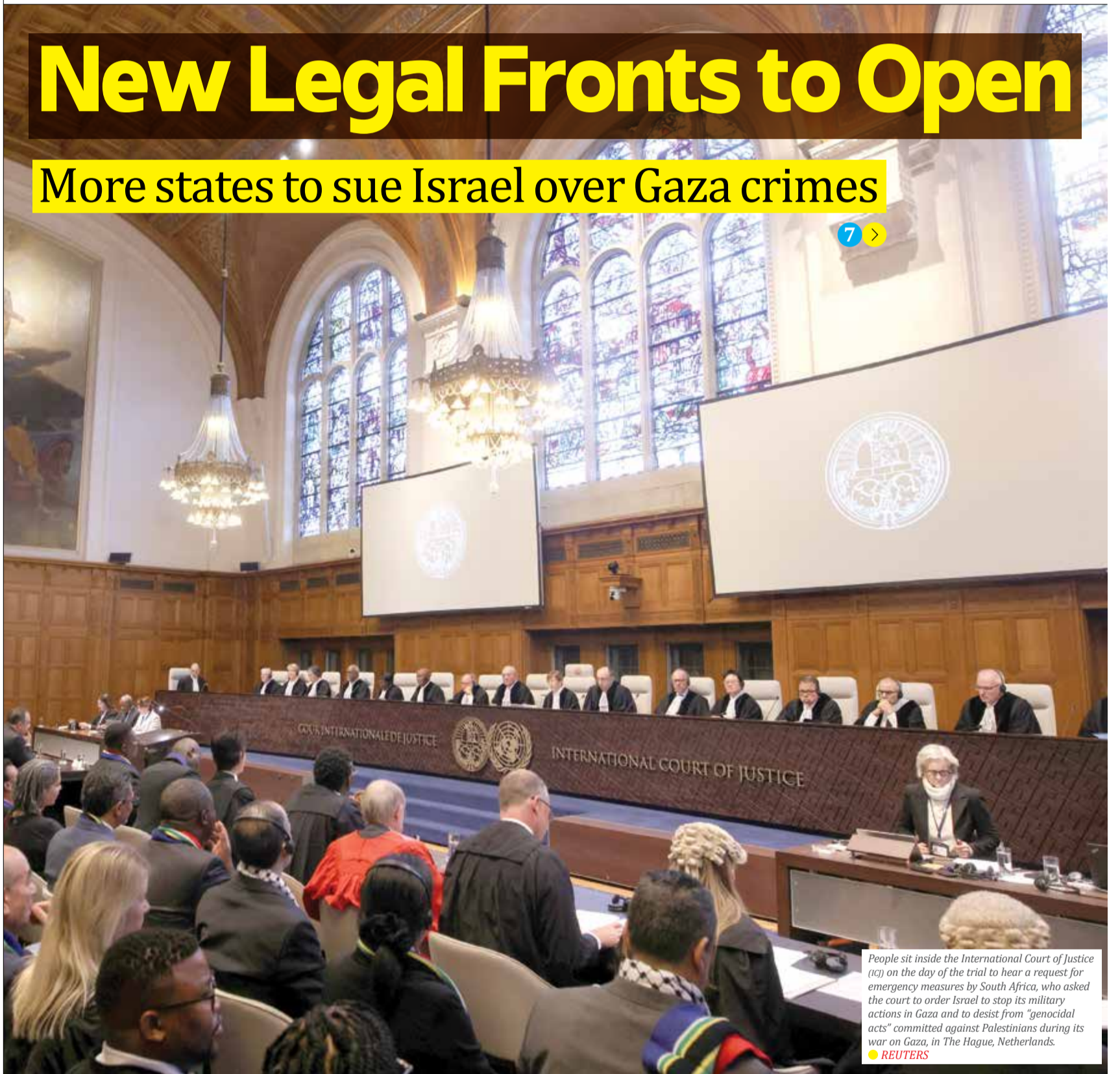
People sit inside the International Court of Justice (ICJ) on the day of the trial to hear a request for emergency measures by South Africa, who asked the court to order Israel to stop its military actions in Gaza and to desist from "genocidal acts" committed against Palestinians during its war on Gaza, in The Hague, Netherlands.