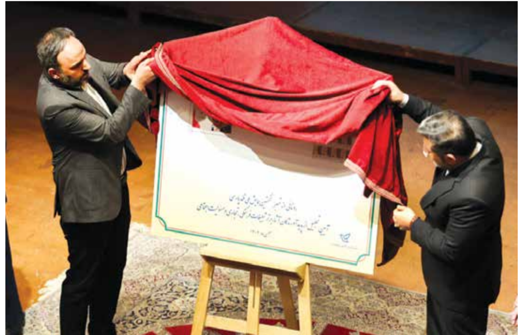
Iran's Minister of Culture and Islamic Guidance Mohammad-Mehdi Esmaeili (R), unveils Qand-e Parsi stamp during a ceremony at Tehran's Rudaki Hall on January 22, 2024, marking the role of renowned poet Ferdowsi in promoting the Persian language.

Esmaeili expressed gratitude to those defending the Persian language, especially highlighting the efforts of colleagues at Islamic Republic of Iran Broadcasting (IRIB), urging against the use of foreign words by senior officials. Addressing historical places, Esmaeili pointed out instances where city names were written in non-Persian script, emphasizing the importance of using Persian names alongside English for cities but denouncing the exclusive use of foreign words.