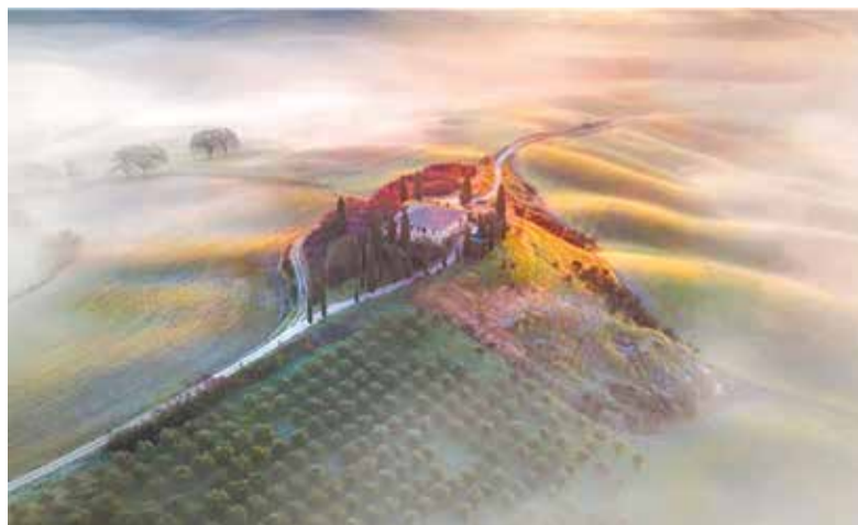
Tuscan hills shrouded in mist