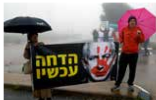
Israeli protesters hold a banner featuring Prime Minister Benjamin Netanyahu during a rally against his far-right cabinet in northern Israel on January 23, 2024.

Former Israeli prime minister Ehud Barak has warned that Israel would find itself "sinking in the Gaza mud for years to come" if Prime Minister Benjamin Netanyahu maintains his fragile grip on power. The stern warning carries weight, considering that Israel's well-equipped army is already mired in the Gaza Strip. Over a hundred days have passed since the Israeli aggression on Gaza, and thus far, Israeli soldiers have failed to uncover any trace of an Israeli captive in Gaza. The loss of 24 Israeli soldiers and officers on Monday in central Gaza is evidence that Hamas remains active. Many Israeli officials labeled Monday as a "difficult day" for Israel. This is the highest number of casualties for the Israeli army since the October 7 attack by Hamas on the occupied territories, even as Israel was gearing up for a post-Hamas Gaza. In recent days, various plans have been put forward for the governance of Gaza after the war, with the central premise of all such proposals being the eradication of Hamas. The heavy blow suffered by the Israeli army on January 22 poured cold water on Israel's and its supporters' plans for post-war Gaza. However, this does not imply that the Israeli war machine has stalled in the Gaza Strip; rather, it exemplifies the challenges that Netanyahu and Israel will face in the days to come, underscoring the complexities of the war in the Palestinian territory. Page 8 > Military superiority will not necessarily guarantee the desired outcomes.