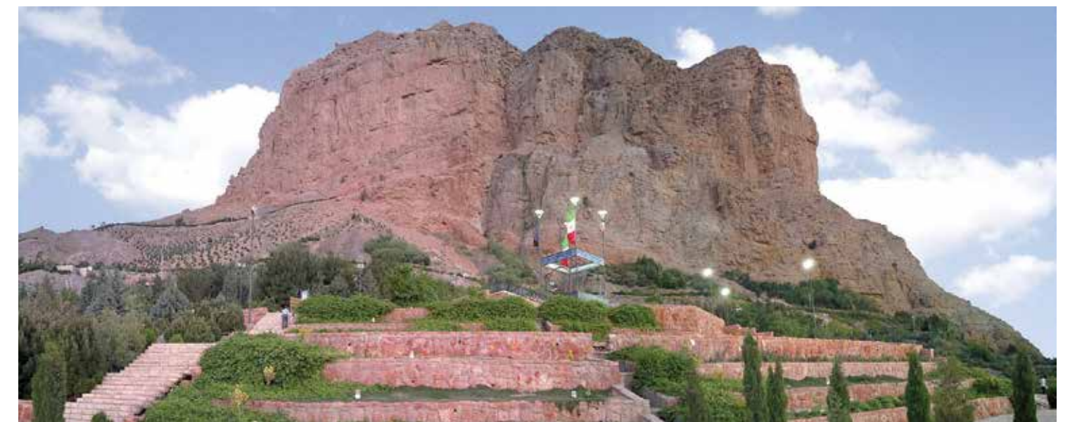
<u> </u> wikiţ