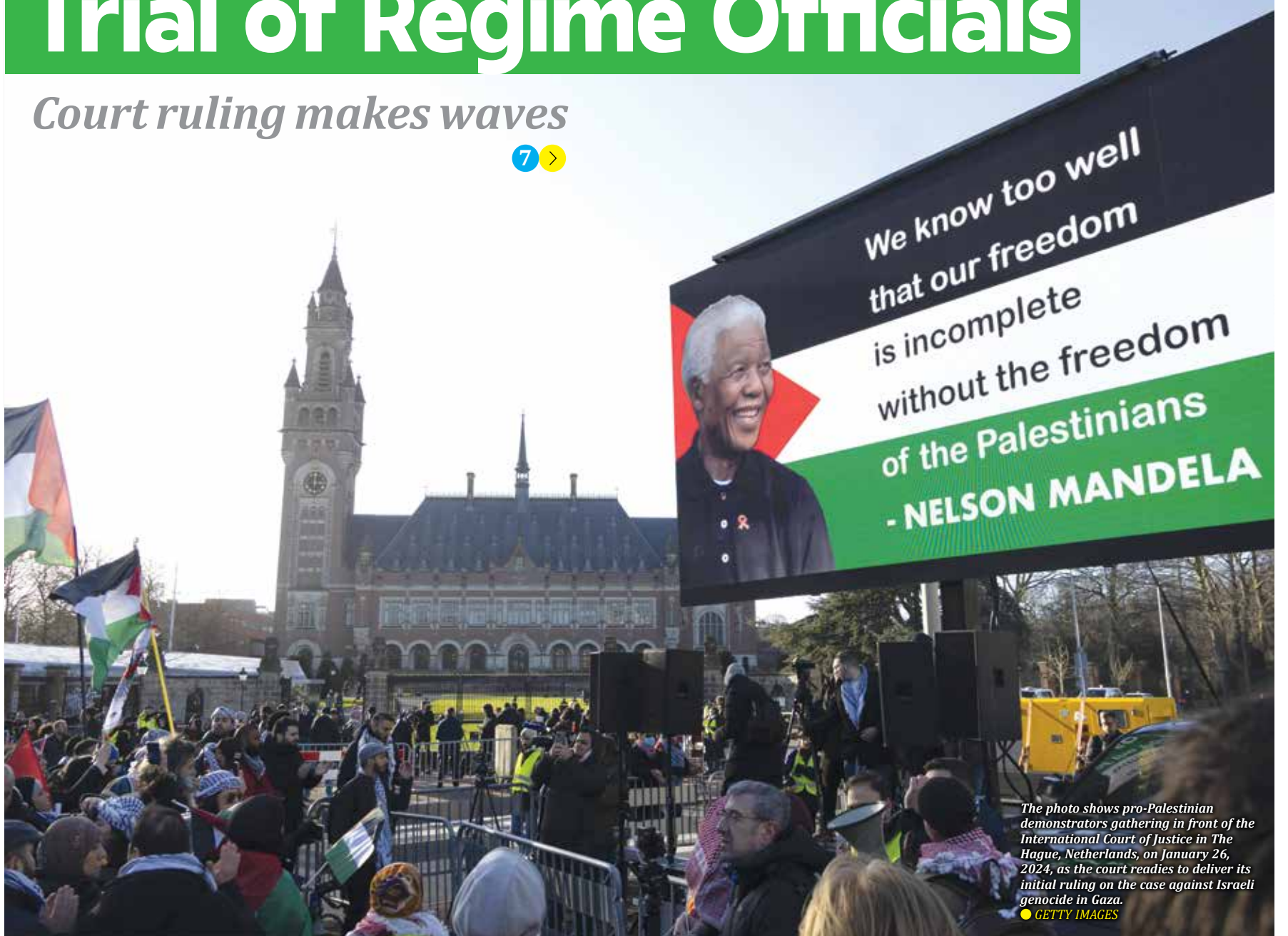
The photo shows pro-Palestinian demonstrators gathering in front of the International Court of Justice in The Hague, Netherlands, on January 26, 2024, as the court readies to deliver its initial ruling on the case against Israeli genocide in Gaza.

Travelers can drive personal vehicles between two countries