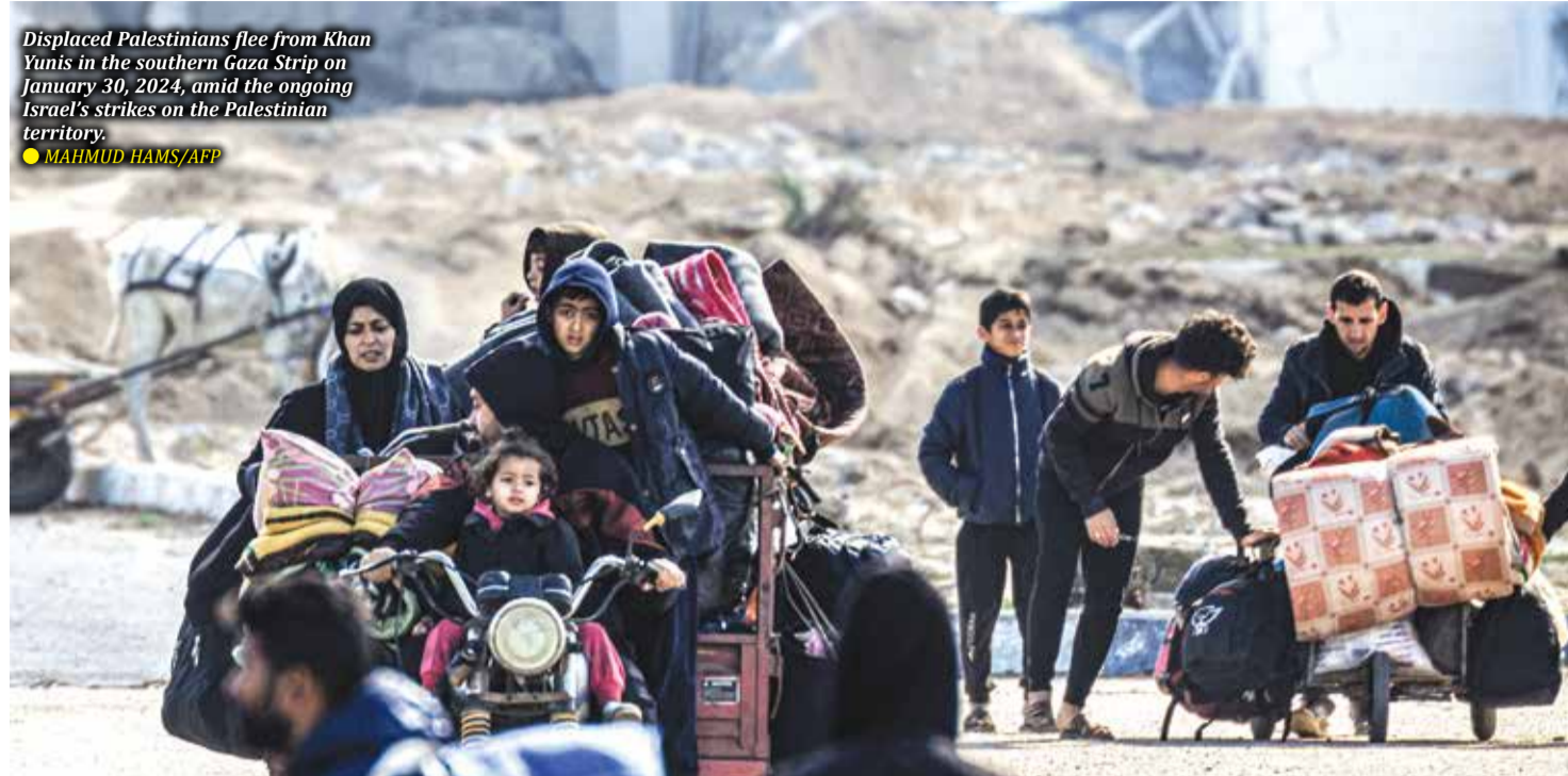
Displaced Palestinians flee from Khan Yunis in the southern Gaza Strip on January 30, 2024, amid the ongoing Israel's strikes on the Palestinian territory.