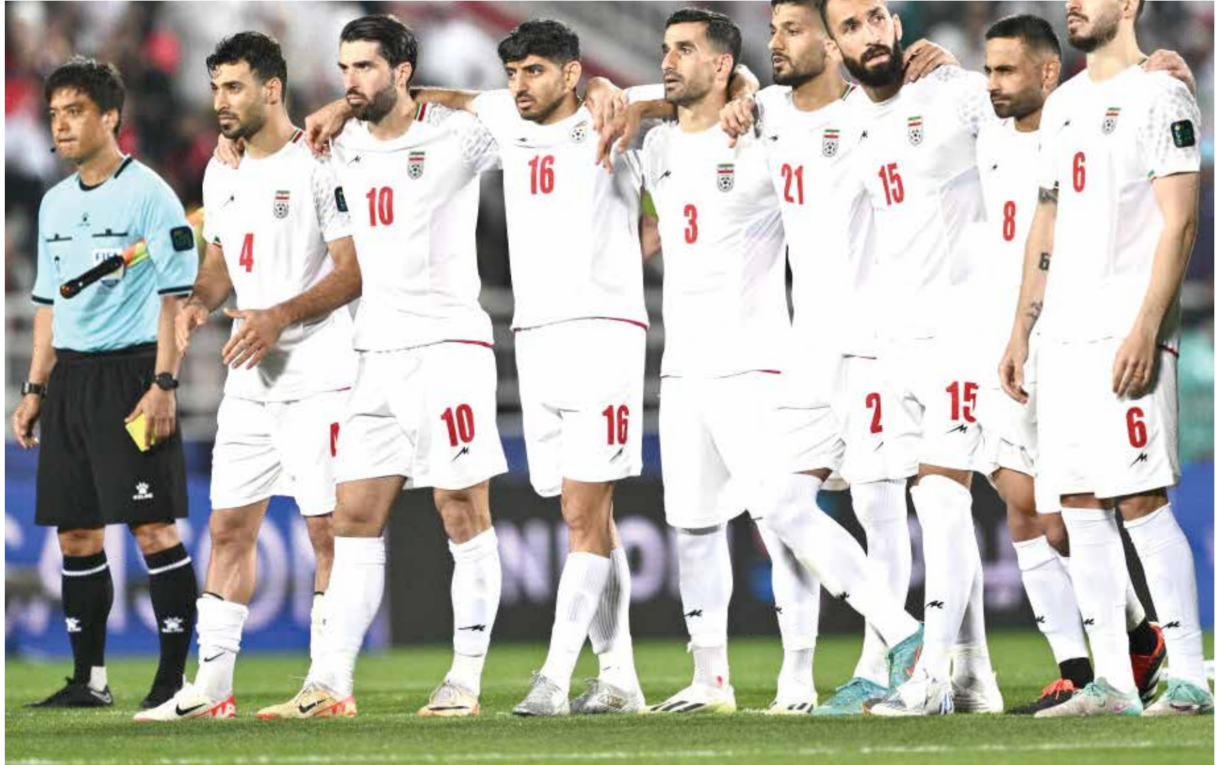
Iranian players look on during the shootout against Syria in the AFC Asian Cup last 16 in Abdullah bin Khalifa Stadium, Doha, Qatar, on January 31, 2024.

The history of the head-to-head between the two sides also make Hajime Moriyasu's men the favorites to progress to the semifinals as Japan was unbeaten in the previous four Asian Cup meetings between the two sides, winning twice, while Iran's last triumph over today's opponent in all competitions dates back to 2005, when Vahid Hashemian bagged a brace for a 2-1 win on home soil