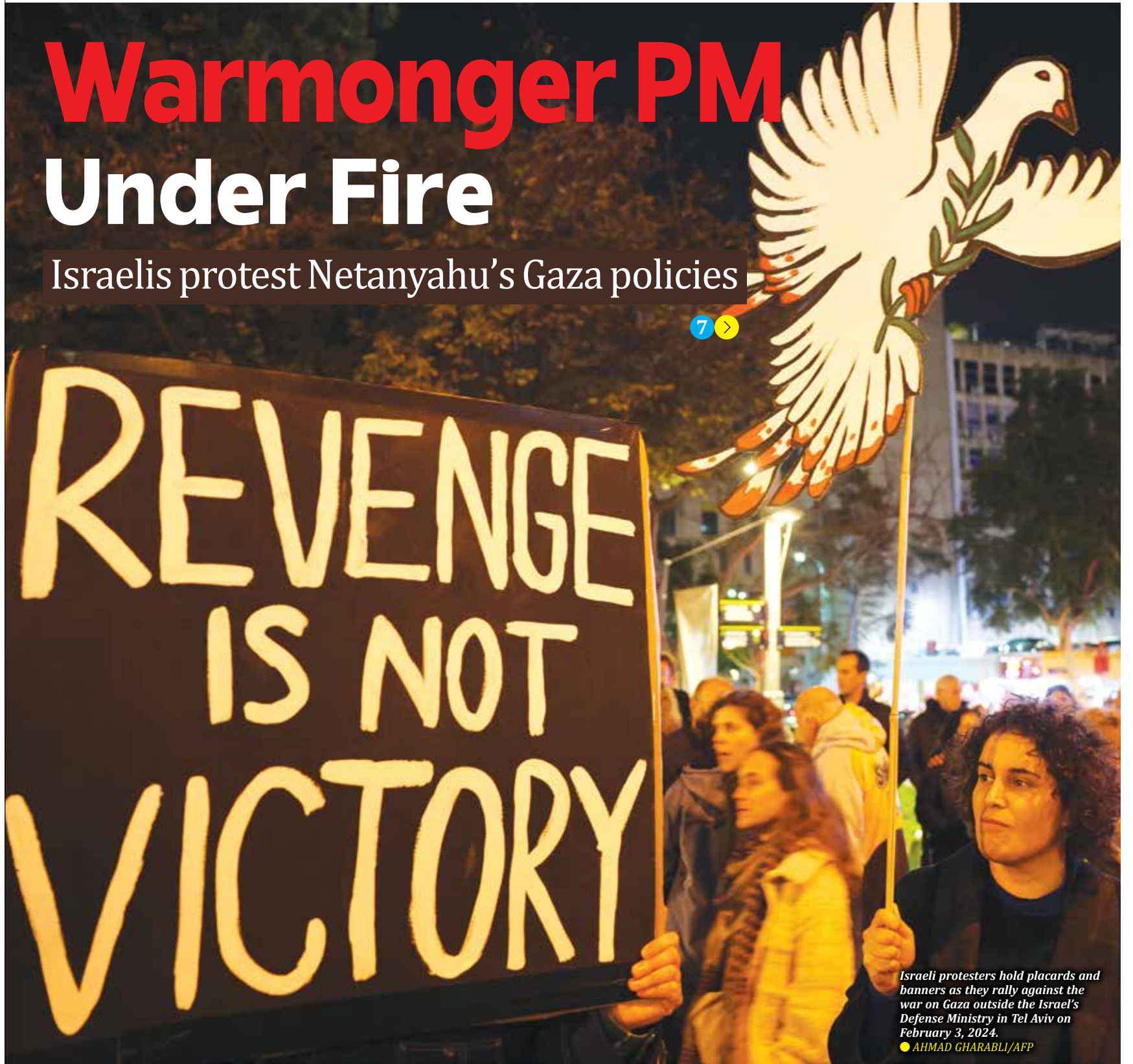
Israeli protesters hold placards and banners as they rally against the war on Gaza outside the Israel's Defense Ministry in Tel Aviv on February 3, 2024.