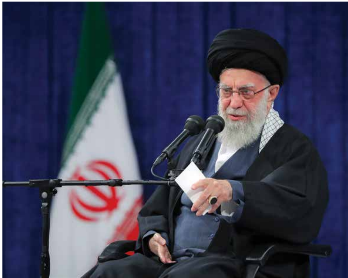
Leader of the Islamic Revolution Ayatollah Seyyed Ali Khamenei speaks during a meeting with a group of commanders and personnel of the Iranian Air Force and Army's Air Defense Force in Tehran on February 5, 2024.

He added that the elites can play a major role in high-turnout parliamentary elections on March 1, whose outcomes, he contended, would boost national might. He further said the elites' negligence toward their duties would lead to a devastating blow to the Iranian nation.