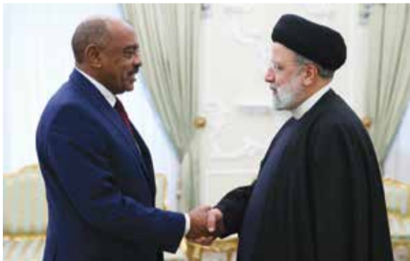
Iranian President Ebrahim Raisi (R) shakes hands with Sudanese Foreign Minister Ali al-Sadiq Ali in a meeting in Tehran on February 5, 2024.

Back in October 2023, Iran and Sudan agreed to re-