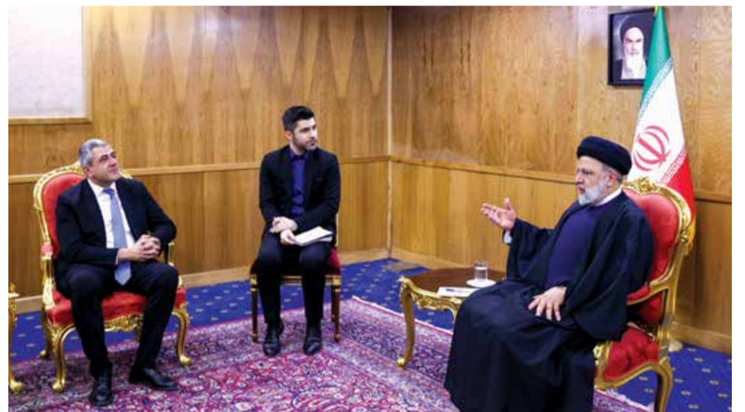
President Ebrahim Raisi (R) and Secretary-General of UN World Tourism Organization Zurab Pololikashvili meet on February 12, 2024 on the sidelines of the 17th International Exhibition of Tourism and Related Industries being held at the Tehran International Permanent Fairgrounds from February 12 to 15.