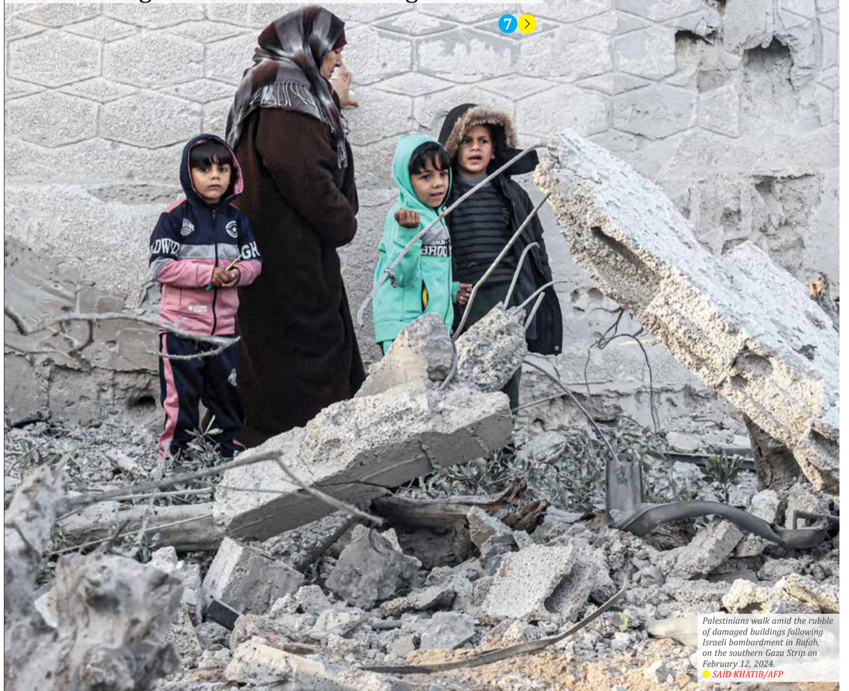
Palestinians walk amid the rubble of damaged buildings following Israeli bombardment in Rafah, on the southern Gaza Strip on February 12, 2024.

Persian Gulf Pro League: Tehran archrivals to resume title race