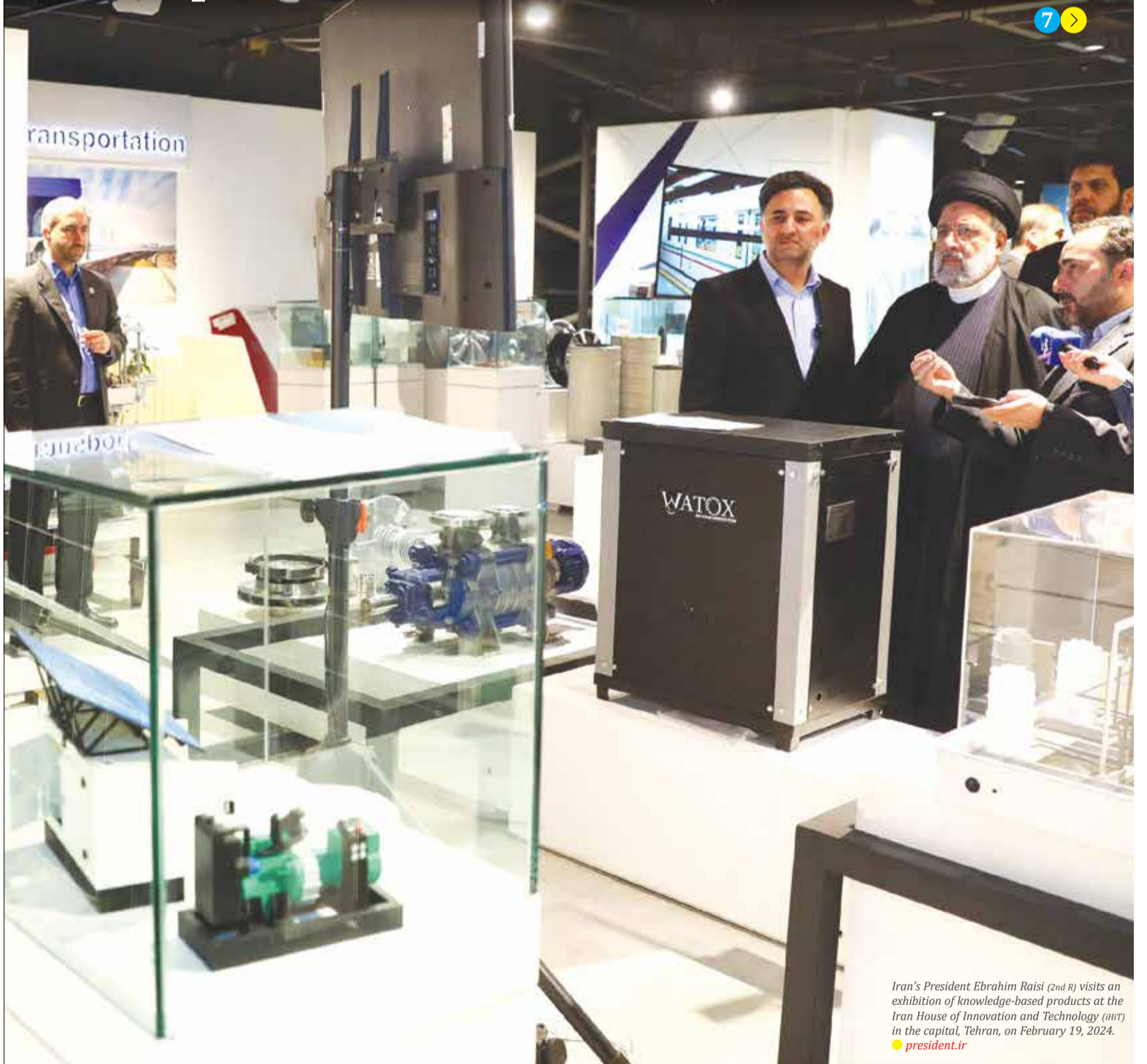
Iran's President Ebrahim Raisi (2nd R) visits an exhibition of knowledge-based products at the Iran House of Innovation and Technology (IHIT) in the capital, Tehran, on February 19, 2024.