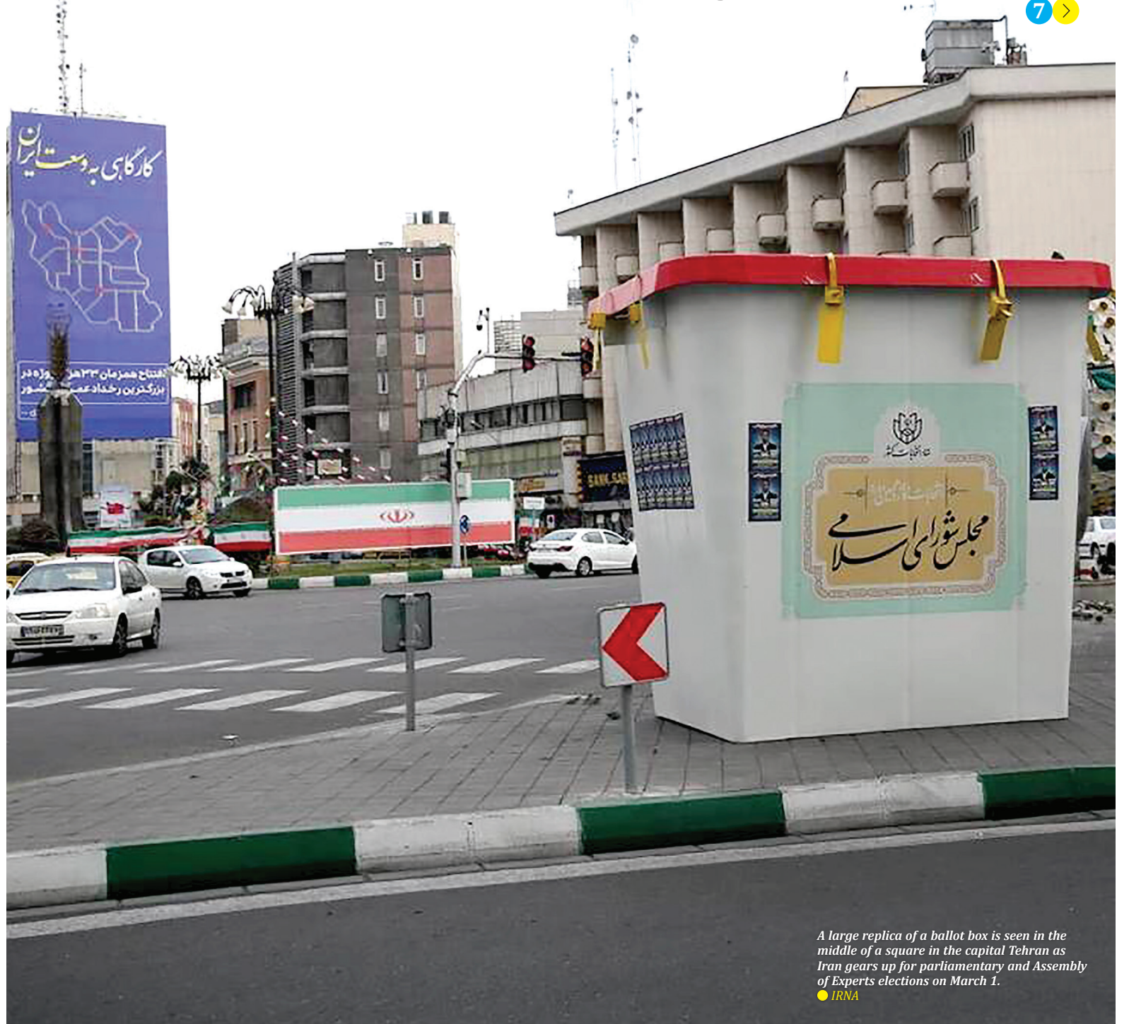
A large replica of a ballot box is seen in the middle of a square in the capital Tehran as Iran gears up for parliamentary and Assembly of Experts elections on March 1.