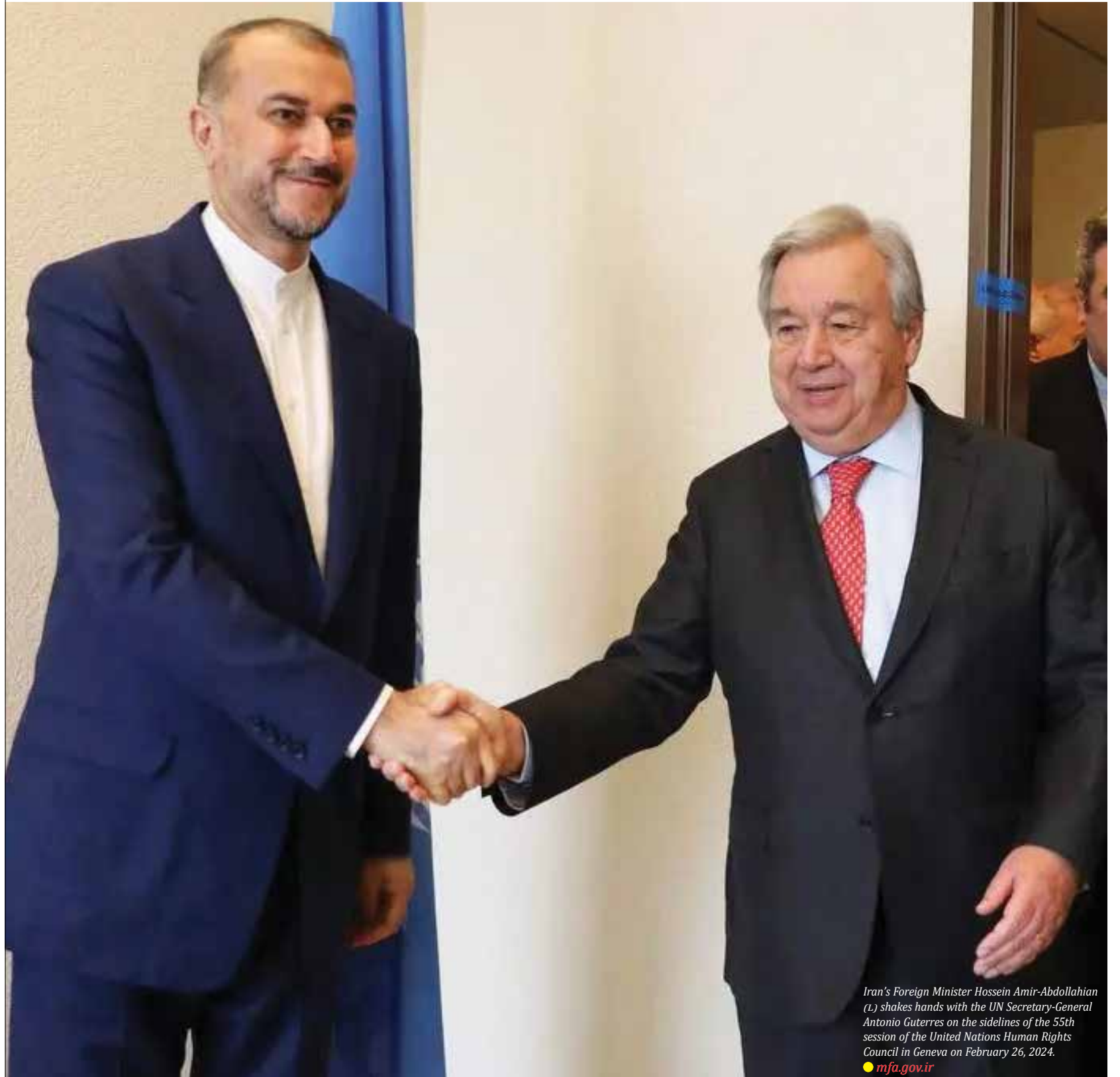
Iran's Foreign Minister Hossein Amir-Abdollahian (L) shakes hands with the UN Secretary-General Antonio Guterres on the sidelines of the 55th session of the United Nations Human Rights Council in Geneva on February 26, 2024.

Security Council inaction on Gaza, Ukraine could 'fatally' hurt its authority: UN chief 7 >