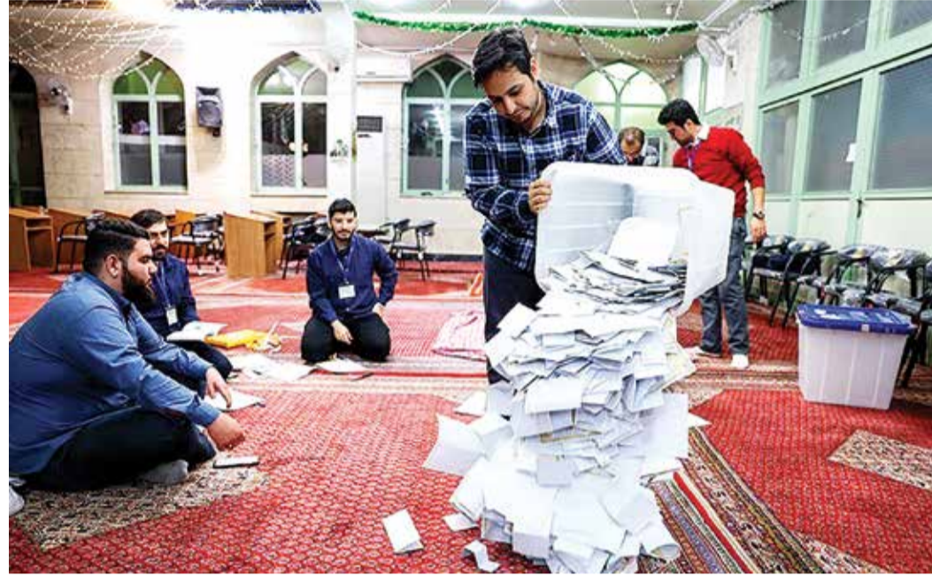
Election officials begin counting votes cast at the parliamentary and the Assembly of Experts elections in Tehran on March 2, 2024.

Candidates for Parliament are vetted by the country's Constitutional Council. It approved a total of 15,200 candidates, out of nearly 49,000 applicants, to run