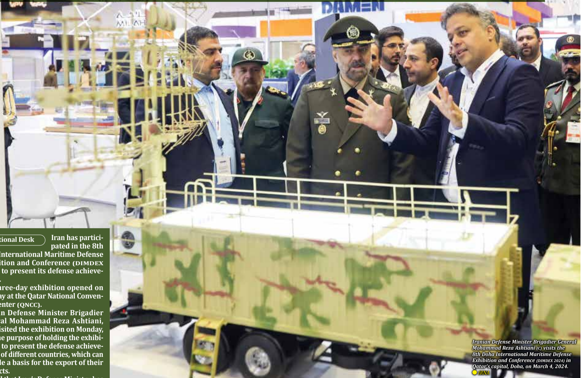
Iranian Defense Minister Brigadier General Mohammad Reza Ashtiani (C) visits the 8th Doha International Maritime Defense Exhibition and Conference (DIMDEX 2024) in Qatar's capital, Doha, on March 4, 2024.

National Desk Iran has participated in the 8th Doha International Maritime Defense Exhibition and Conference (DIMDEX 2024) to present its defense achievements. The three-day exhibition opened on Monday at the Qatar National Convention Center (QNCC). Iranian Defense Minister Brigadier General Mohammad Reza Ashtiani, who visited the exhibition on Monday, said the purpose of holding the exhibition is to present the defense achievements of different countries, which can provide a basis for the export of their products. He said that Iran's Defense Ministry has showcased its products such as long-range radars and various types of air defense systems. According to the exhibition organizers, the DIMDEX 2024 aims to lay the groundwork for increased cooperation among relevant stakeholders. Its main goal is to build partnerships and alliances that focus on establishing security and stability in the seas and oceans, positively affecting the economic and social well-being of nations and communities.