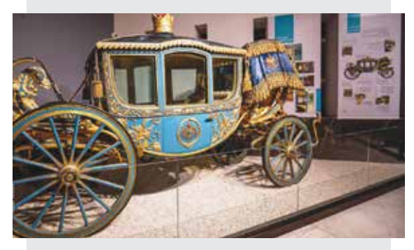
A carriage section, featuring historical carriages and chariots such as Nassereddin Shah's carriage, opened at Museum of Historical Cars of Iran on March 10, 2024.