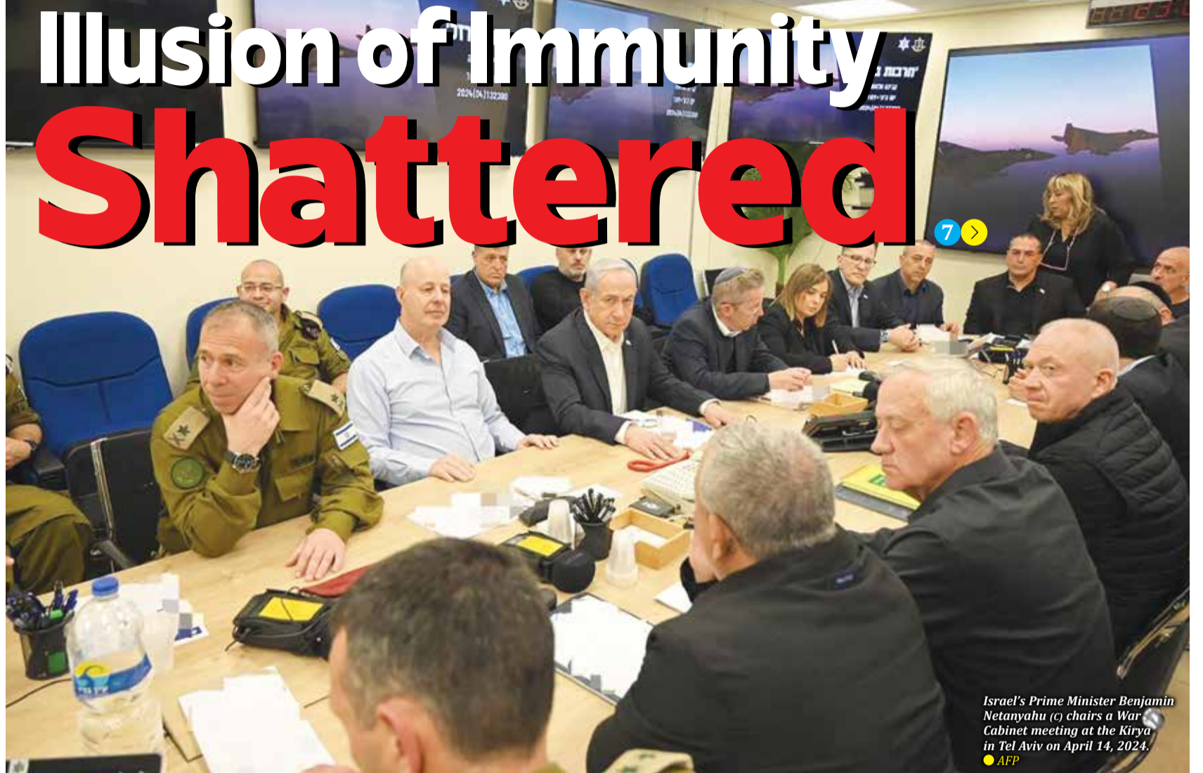
Israel's Prime Minister Benjamin Netanyahu (c) chairs a War Cabinet meeting at the Kirya in Tel Aviv on April 14, 2024.