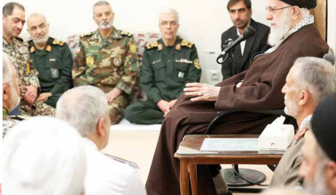
Leader of the Islamic Revolution Ayatollah Seyyed Ali Khamenei addresses a group of high-ranking Iranian military commanders and figures in the capital Tehran on April 21, 2024.

The airstrike killed two senior Iranian military personnel who were on an advisory mission to Syria as well as five of their accompanying officers.