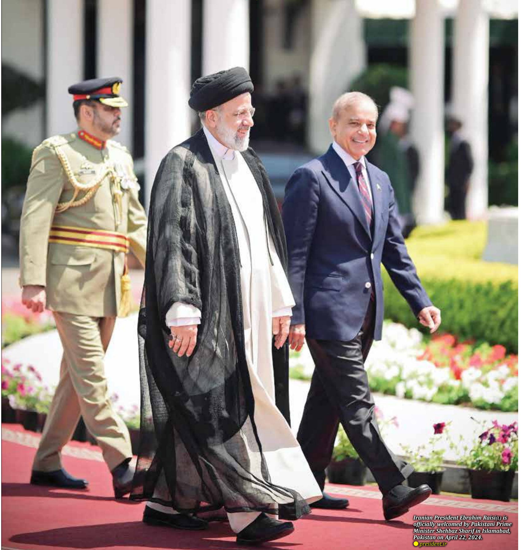
Iranian President Ebrahim Raisi (C) is officially welcomed by Pakistani Prime Minister Shehbaz Sharif in Islamabad, Pakistan on April 22, 2024.