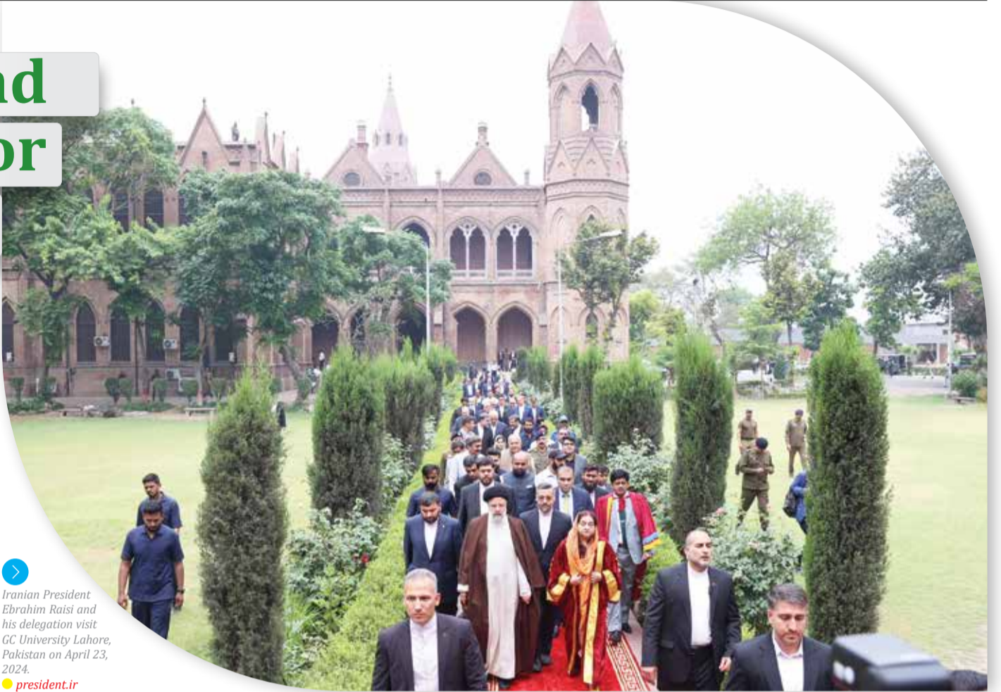
Iranian President Ebrahim Raisi and his delegation visit GC University Lahore, Pakistan on April 23, 2024.

ern claims of freedom of thought, citing instances of student expulsion for supporting oppressed causes such as Palestine. "What we see in practice is that a large number of students are expelled from the university (in the US) just for supporting the oppressed people of Gaza. Is this called freedom of thought!?" he said. He denounced Western hypocrisy in defending human rights while supporting actions that violate them, particularly in the case of Palestine. He expressed confidence in the eventual liberation of Palestine and Al-Quds, condemning Zionist aggression and emphasizing the solidarity of Iran and Pakistan in defending the oppressed. "We have no doubt that the resistance of the heroic nation of Palestine will liberate Gaza, Palestine and the Al-Quds. We have no doubt that the hatred that has been created in the Islamic world and the world of humanity towards the Zionists and Americans will become the revenge of the nations and the end of the Zionist regime and the end of this child-killing regime," the president noted. Pointing to Iran's recent retaliatory operation against the Israeli military targets, the president