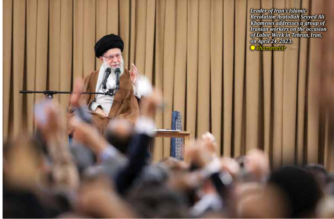
Leader of Iran's Islamic Revolution Ayatollah Seyyed Ali Khamenei addresses a group of Iranian workers on the occasion of Labor Week in Tehran, Iran, on April 24, 2023.