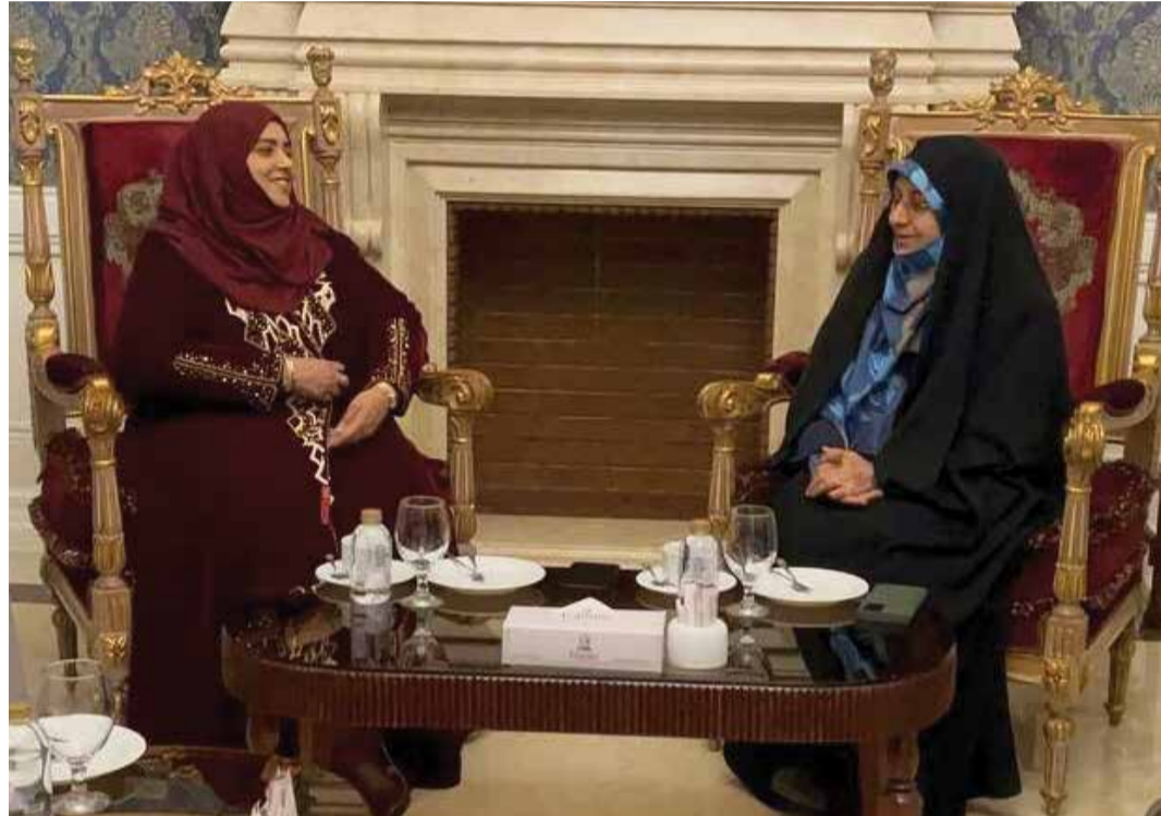
Iran's Vice President for Women and Family Affairs Ensieh Khazali (l) and Oman's Minister of Social Development Laila Ahmed Al Najjar discuss cultural and social cooperation in a meeting held in Tehran on April 28, 2024.

During a meeting between Ensieh Khazali, the Vice President for Women and Family Affairs, and Oman's Minister of Social Development, Laila Ahmed Al Najjar, both parties stressed the importance of strengthening bilateral relations, particularly regarding women and family affairs. Al Najjar, who traveled to the Iranian capital city of Tehran, met and held discussions with Iran's Vice President for Women and Family Affairs after visiting the Iran Expo where she was briefed on the achievements of the Islamic Republic of Iran on Sunday, IRNA wrote. Al Najjar discussed with Khazali the cultural and social similarities between Iran and Oman, proposing joint projects in family-related fields and suggesting the organization of joint exhibitions for women, especially focusing on handicrafts and knowledge-based companies. Khazali highlighted the need for unity among Islamic countries to address the oppression and crimes perpetrated by the Zionist regime in Gaza. The meeting concluded with a mutual agreement to explore further collaborative opportunities to enhance ties between the two nations.