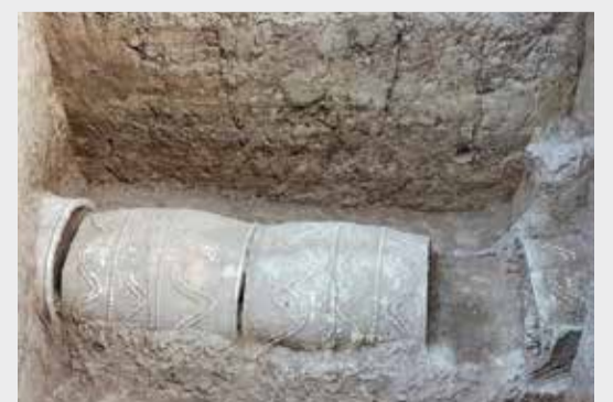
Iranian archaeologists unearthed ancient objects in Isfahan's Kamar Zarrin at the end of the first season of archaeological exploration.