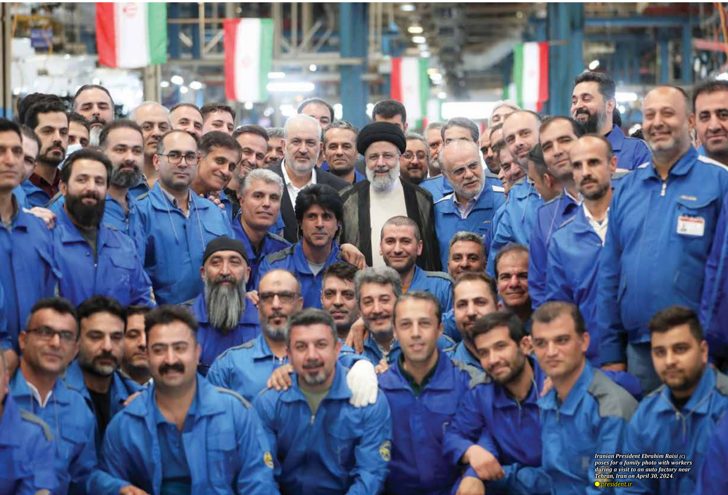
Iranian President Ebrahim Raisi (C) poses for a family photo with workers during a visit to an auto factory near Tehran, Iran on April 30, 2024.

Raisi hails workers for bringing hope to society 2 >