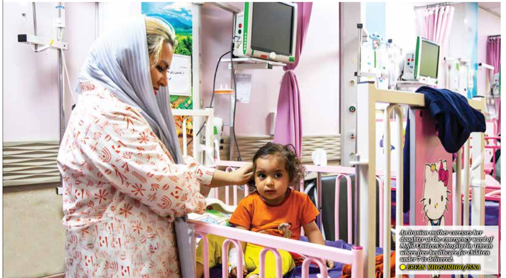
An Iranian mother caresses her daughter at the emergency ward of Mofid Children's Hospital in Tehran where free healthcare for children under 7 is delivered.