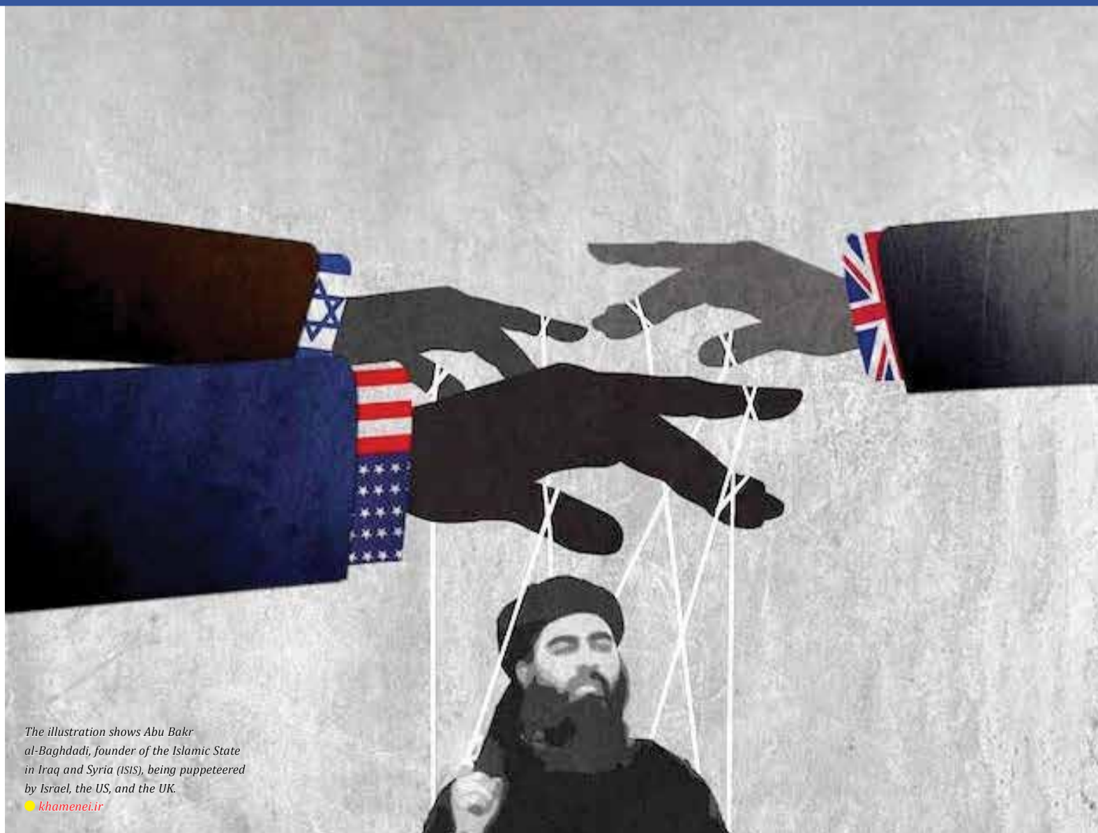
The illustration shows Abu Bakr al-Baghdadi, founder of the Islamic State in Iraq and Syria (ISIS), being puppeteered by Israel, the US, and the UK.

What this article intends to prove is that, contrary to what the leaders and media organs of this seemingly Islamic group show, ISIS is entirely in service to the interests of the United States and especially the Zionist regime in the region.