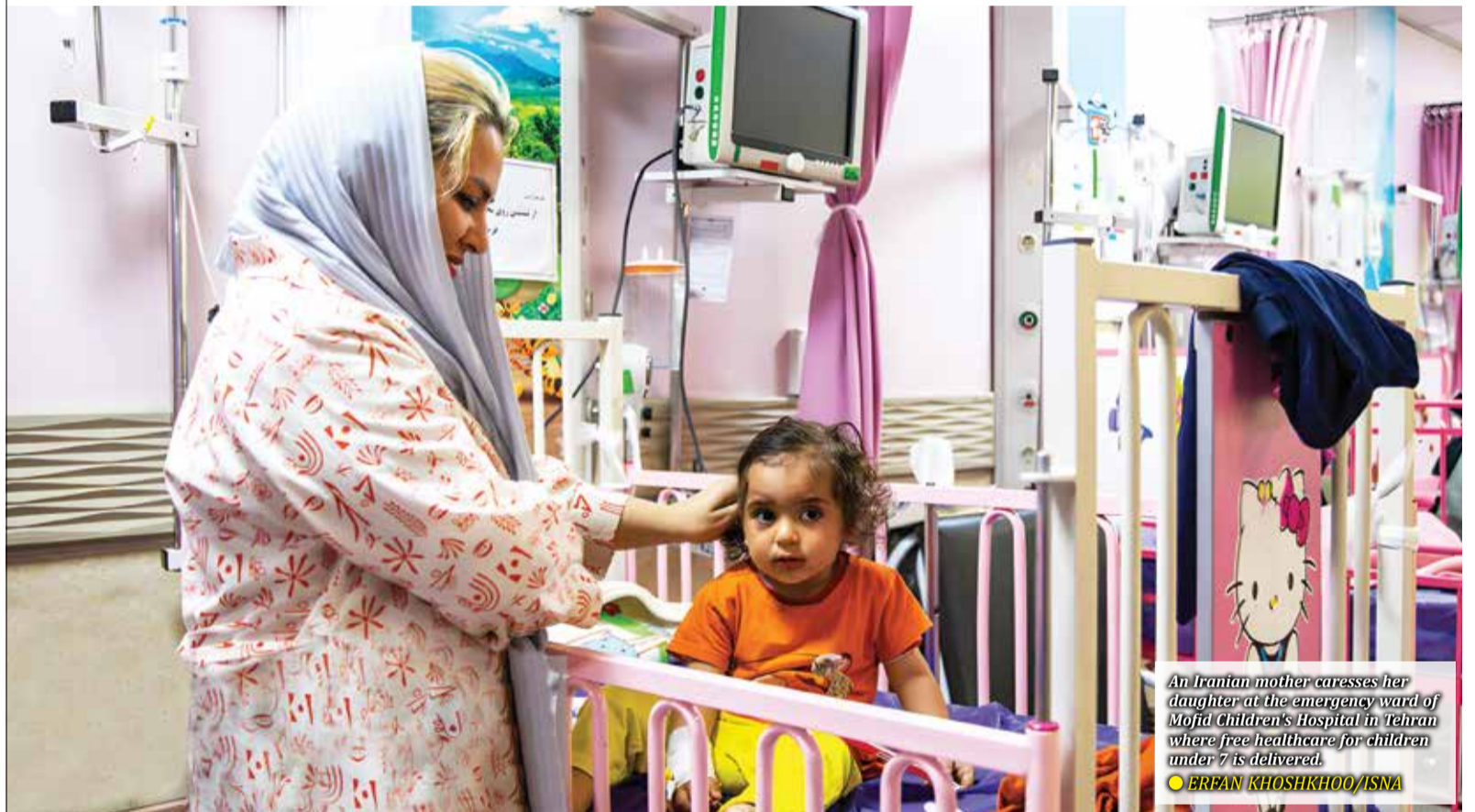
An Iranian mother caresses her daughter at the emergency ward of Mofid Children's Hospital in Tehran where free healthcare for children under 7 is delivered.