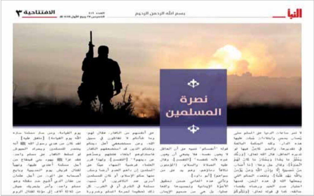
The photo shows the Arabic editorial published by ISIS in al-Naba Weekly on October 21, 2023, where the terrorist group finally addressed the suffering of Gazans at the hands of the Israelis.