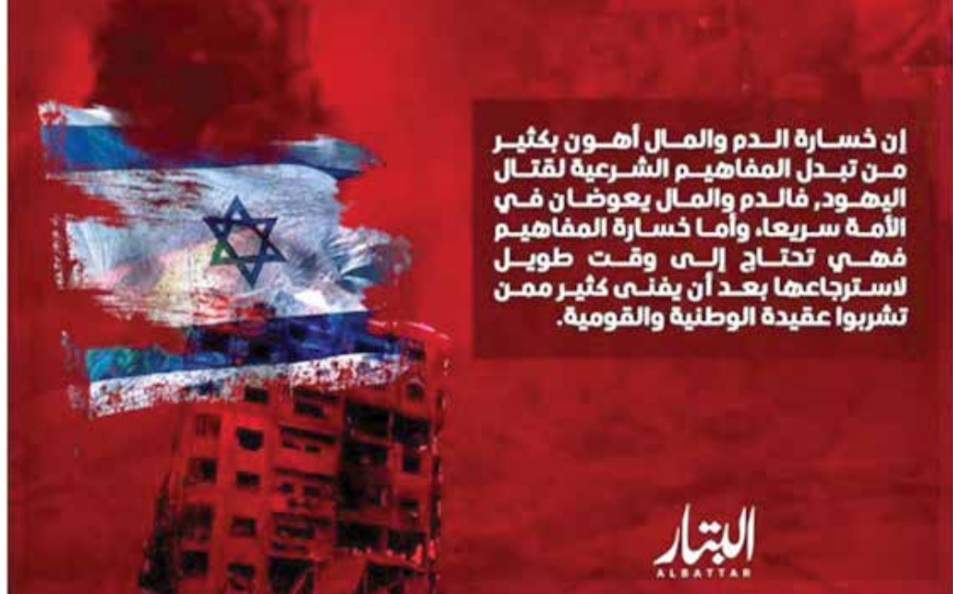
ISIS's Al-Battar Foundation criticizes the national take on Operation Al-Aqsa Storm in an infographic titled "Which way are you walking?", an Arabic excerpt of which is reflected in this photo.