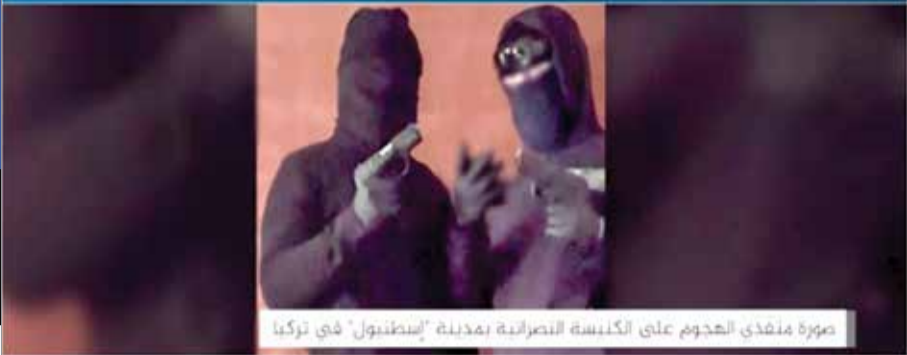
صورة منشدي الهجوم على الكنيسة النصرانية بمدينة "إسطنبول" في تركيا

تركيا - إسطنبول - وكالة أعماق: نفذ مقاتلان من الدولة الإسلامية هجوما مسلحا على كنيسة للنصارى بمدينة "إسطنبول" التركية. وقال مصدر أمني لوكالة أعماق إن مقاتلين من الدولة الإسلامية هاجما صباح اليوم، الأحد، كنيسة للنصارى في حي "بويوكدير" بمدينة "إسطنبول". وأضاف المصدر أن الهجوم وقع أثناء تأدية النصارى لطقوسهم المعتادة يوم الأحد، وأسفر عن مقتل نصراني وإصابة آخر بجروح. وأكد المصدر انسحاب منفذي الهجوم من مكان العملية بسلام. وبين المصدر أن الهجوم جاء استجابة لنداء قادة الدولة الإسلامية باستهداف اليهود والنصارى في كل مكان. 28 يناير 2024