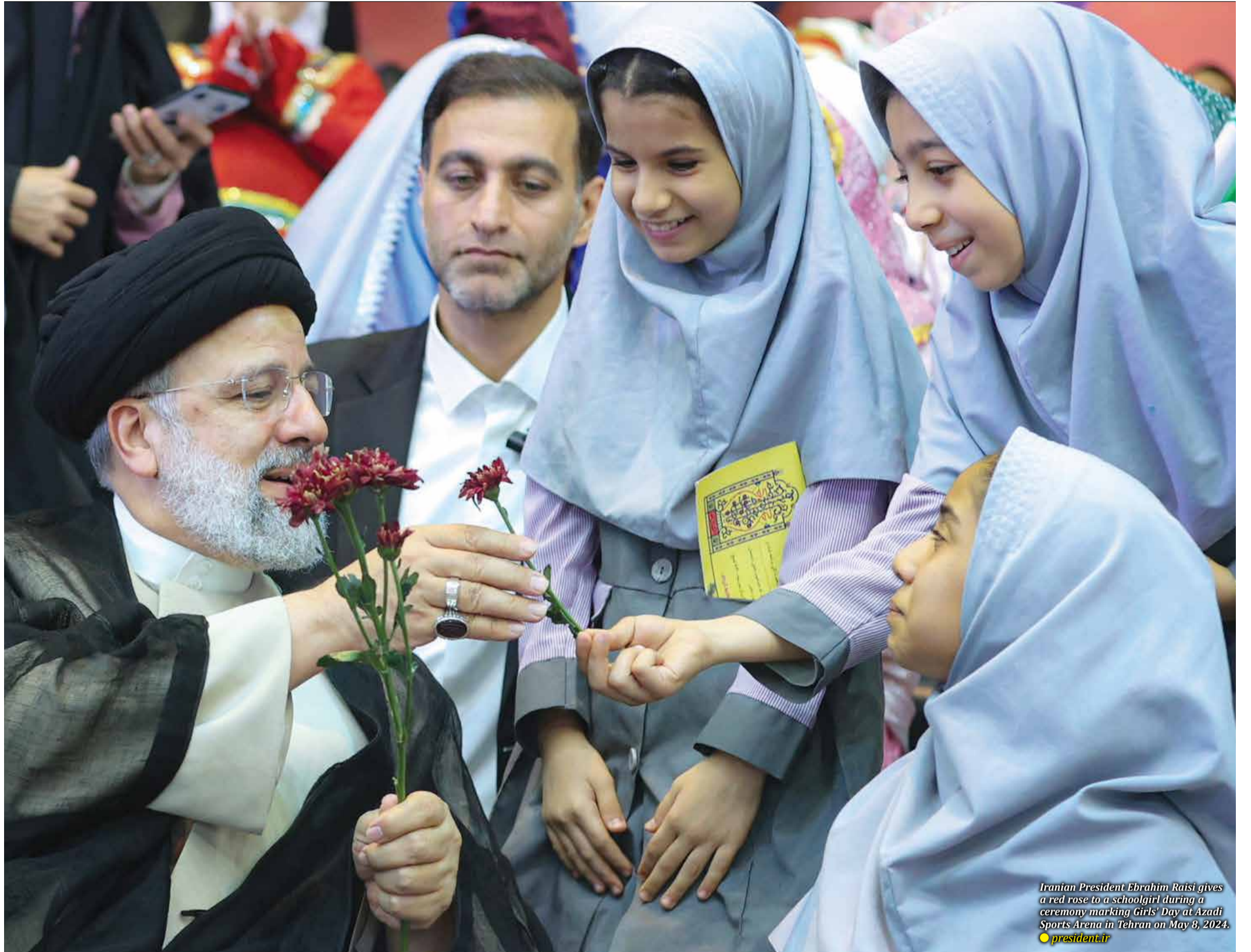
Iranian President Ebrahim Raisi gives a red rose to a schoolgirl during a ceremony marking Girls' Day at Azadi Sports Arena in Tehran on May 8, 2024.

Vol. 7553 • Thursday, May 9, 2024 • Ordibehesht 20, 1403 • Shawwal 30, 1445 • 100,000 rials • 8 pages