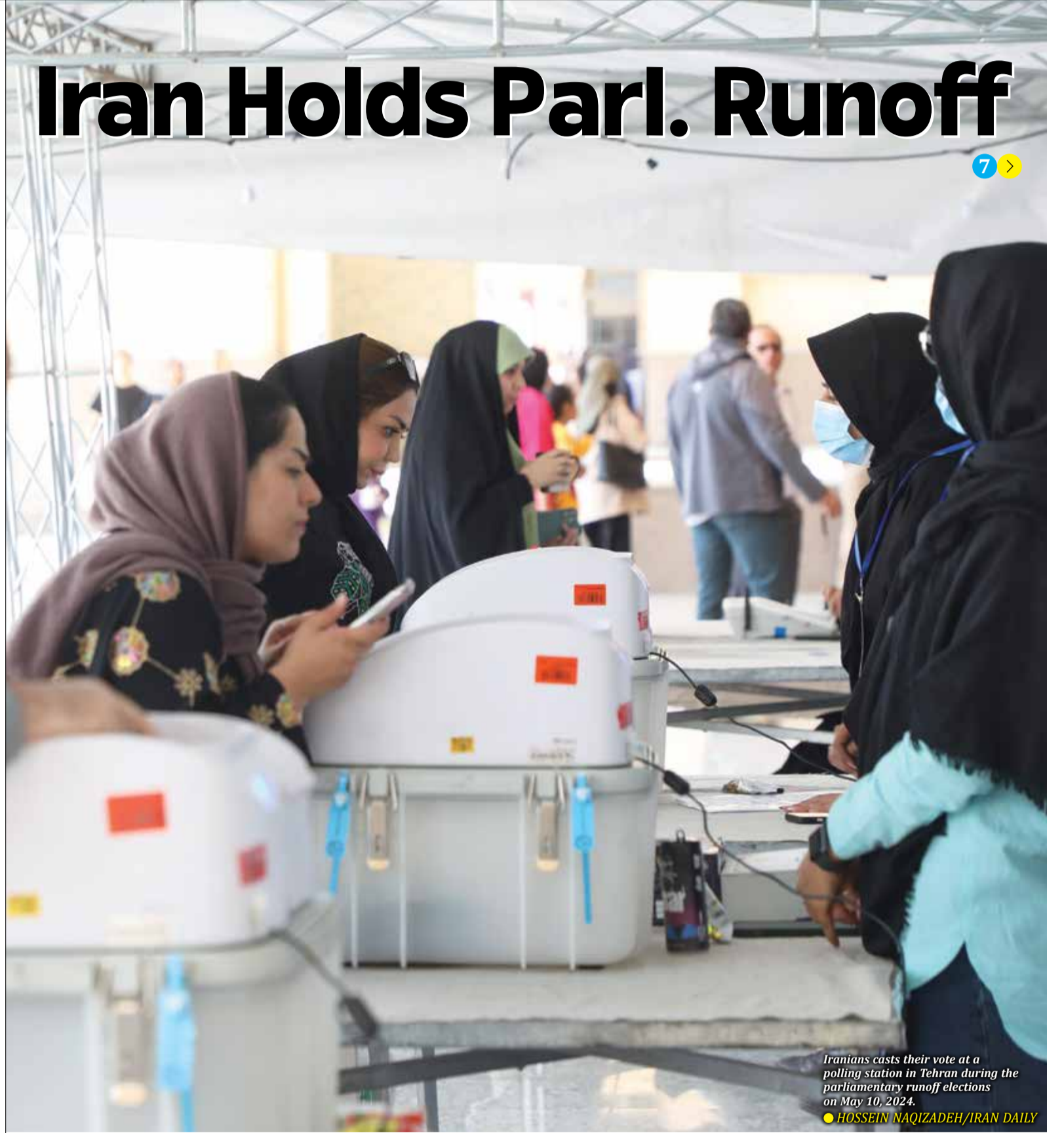
Irans cast their vote at a polling station in Tehran during the parliamentary runoff elections on May 10, 2024.