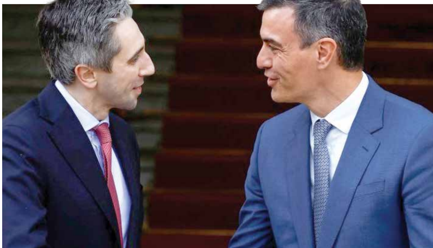
Spain's Prime Minister Pedro Sanchez (R) and Ireland's new Taoiseach Simon Harris speak as they meet to discuss recognising the Palestinian state in Dublin, Ireland.

Prime Minister Pedro Sanchez, a longtime supporter of Palestinian rights, sees recognition as a way of reaching a two-state solution and a possible key to ending the devastating conflict that began in October.