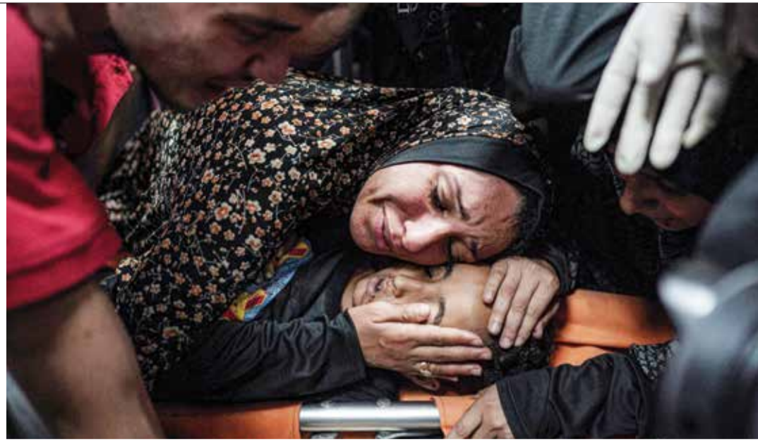
A woman mourns over the body of a child who succumbed to his injuries caused by Israel's bombardment on a refugee camp in Deir el-Balah in the central Gaza Strip on May 11, 2024.