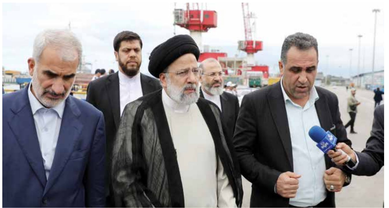
Iranian President Ebrahim Raisi (c) visits Nowshahr Port in northern Iranian province of Mazandaran on May 17, 2024.

"In this trip, we will monitor the quality of the implementation of these resolutions to see the impact of the steps taken