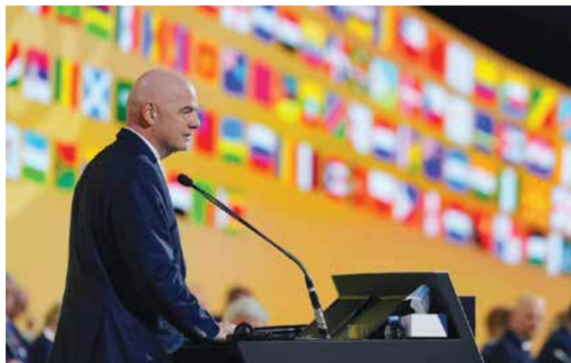
President Gianni Infantino makes a speech during the international football governing body's annual congress in Bangkok, Thailand, on May 17, 2024.

"I ask you to stand on the right side of history ... If not now, when?" said PFA President Jibril Rajoub, speaking before delegates from 211 member associations. "FIFA cannot afford to remain indifferent to these violations or the ongoing genocide in Palestine." Infantino said FIFA "will mandate as