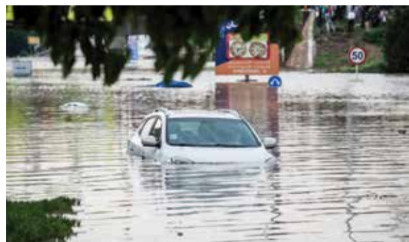
A car inundated with floodwater is seen in the northeastern city of Mashhad in Khorasan Razavi Province, Iran, on May 15, 2024.