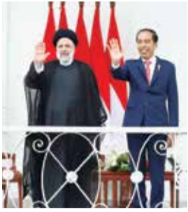
Iranian President Ebrahim Raisi (L) and Indonesian President Joko Widodo wave to photographers during their meeting at the Presidential Palace in Bogor, Indonesia, May 23, 2023.