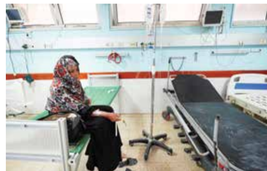
A Palestinian woman receives medical care at the European hospital in Khan Yunis in the southern Gaza Strip on May 17, 2024.

growing risk of shutting down as Israel presses on with its Rafah offensive. Since Israel began its Rafah incursion on May 7, at least 630,000 Palestinians sheltering there have been forced out, according to the UN Agency for Palestinian Refugees (UNRWA).