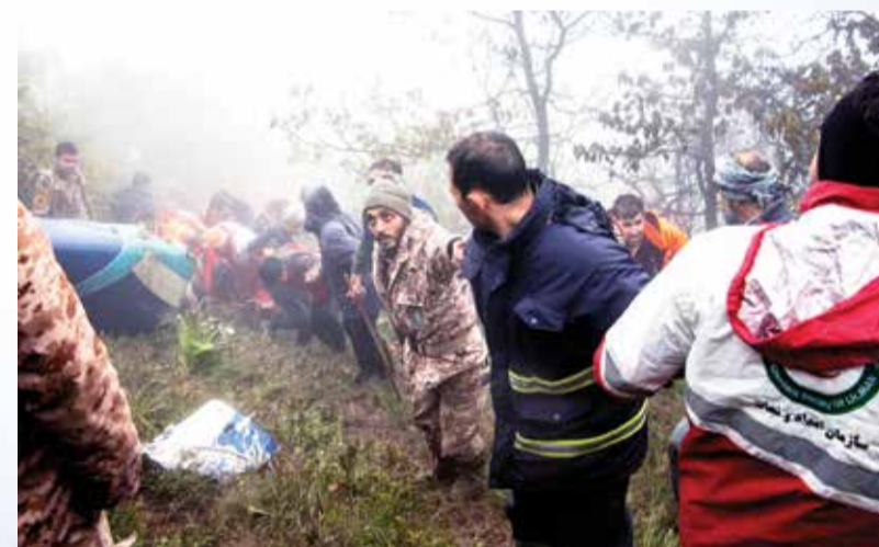
Rescuers retrieve bodies at the crash site of a helicopter transporting Iran's President, his Foreign Minister, and others in a fog-covered mountainous area of Varzaqan in northwestern Iran on May 20, 2024.

Following the tragic incident, the world leaders and presidents as well as international figures and personalities voiced their sorrow over the loss of Raisi and his entourage.