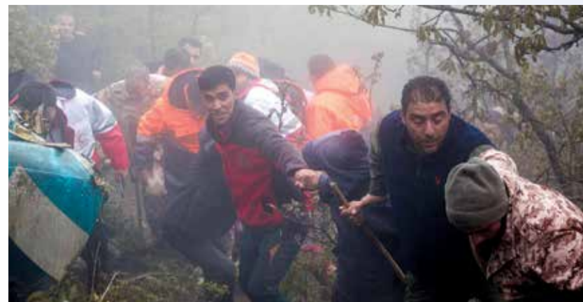
Rescue team members work at the crash site of a helicopter carrying Iranian President Ebrahim Raisi in Varzaqan, in northwestern Iran, on May 20, 2024.

holy shrines across the country, particularly the shrine of Imam Reza (PBUH), the eighth Shia Imam, in the northeastern city of Mashhad started praying for the health of Raisi and his accompanying delegation.