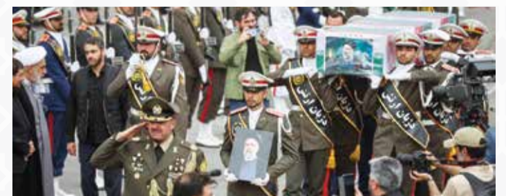
Coffins containing bodies of President Ebrahim Raisi and Foreign Minister Hossein Amir-Abdollahian arrive at Mehrabad Airport, Tehran, Iran, on May 21, 2024 for funeral ceremonies in the Iranian capital and the nearby holy city of Qom.