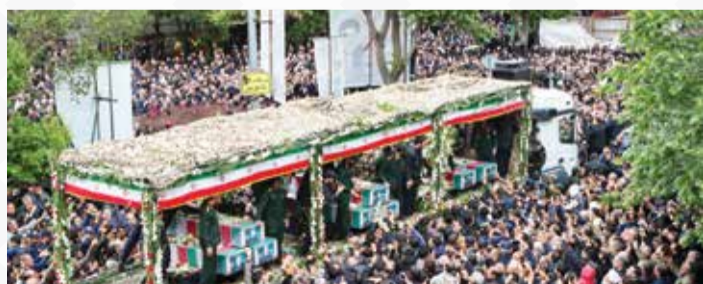
People bid farewell to Iranian President Ebrahim Raisi, Foreign Minister Hossein Amir-Abdollahian in Tabriz, northwestern Iran, on May 21, 2024 after they died in a helicopter crash on May 19.