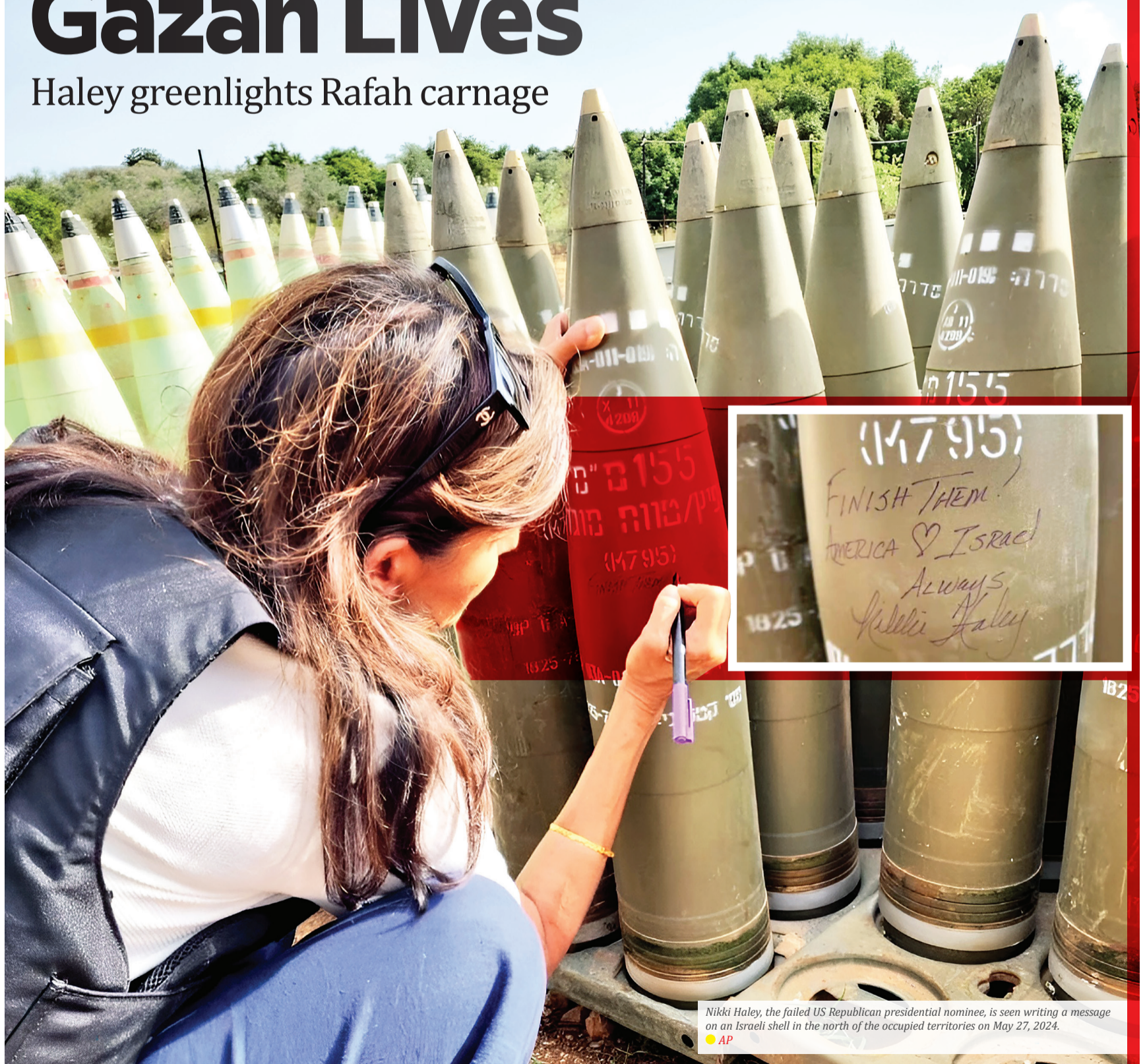
Nikki Haley, the failed US Republican presidential nominee, is seen writing a message on an Israeli shell in the north of the occupied territories on May 27, 2024.