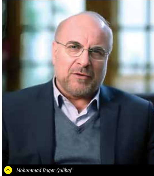
Mohammad Baqer Qalibaf

On the other hand, Palestinian resistance groups have demonstrated remarkable resilience, as evidenced by the fact that despite Israel's continuous perpetration of crimes, only four prisoners have been released—leaving 160 others still under Hamas' custody. While these crimes might impede cease-fire negotiations, the Palestinian people have, after eight grueling months of war, acknowledged that their sole viable recourse is resistance, as reliance on the West and Arab nations has proven futile.