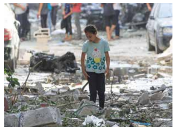
A Palestinian girl walks amidst the debris a day after Israel's attacks on the Nuseirat camp in the central Gaza Strip on June 9, 2024.

Iran's Foreign Ministry blamed the latest killing of hundreds of Palestinians on "inaction" by world governments and the UN Security Council. "These horrific and shocking crimes... are the result of the inaction of governments and responsible international bodies, including the United Nations Security Council, in the face of eight months of war crimes and violations by the Zionist regime [Israel]," spokesman Nasser Kanaani said in a statement.