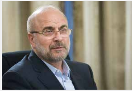
Mohammad Baqer Qalibaf