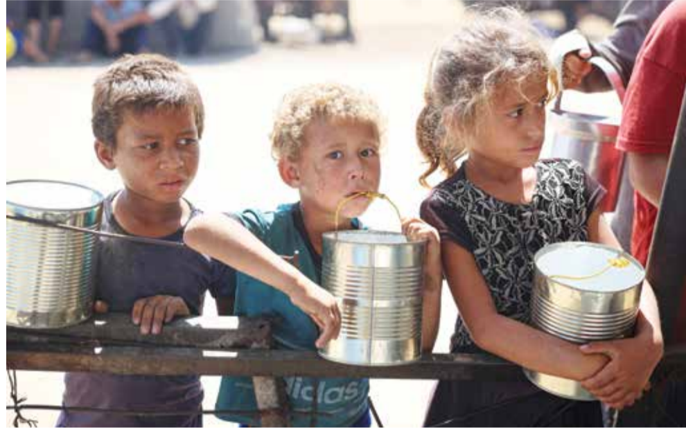
Children wait for food at a camp for displaced people where they live due to the Israeli bombardment in Khan Yunis in the southern Gaza Strip on June 11, 2024.

Hamas resistance group accepted a UN resolution backing a plan to end the war with Israel in Gaza and is ready to negotiate details, a senior official of the Palestinian group said on Tues-