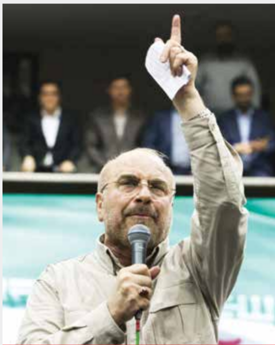
Mohammad Baqer Qalibaf