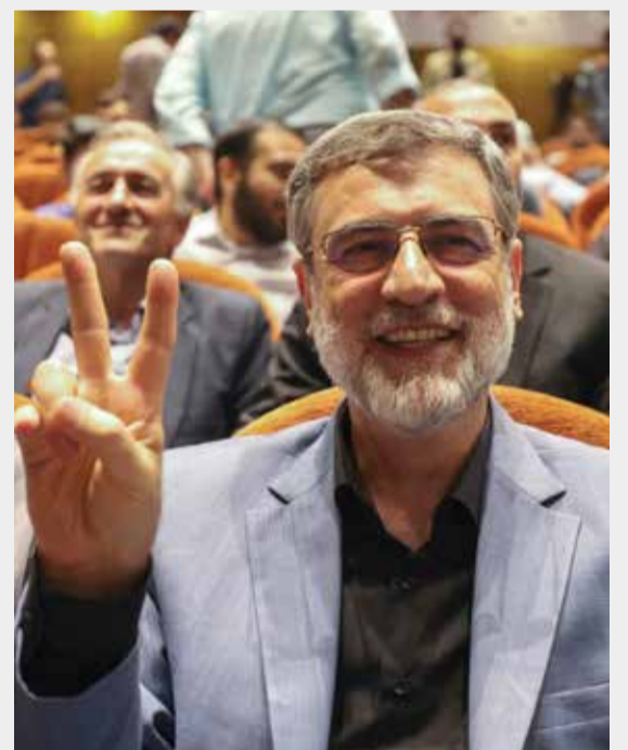
Amir Hossein Ghazizadeh Hashemi

Trump's trial shows legal system works, but his rhetoric left scars