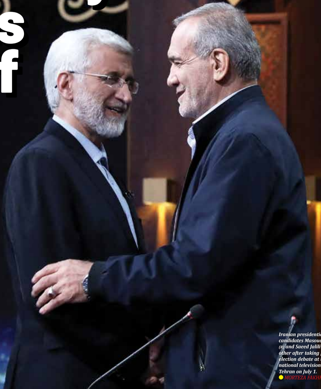
Iranian presidential candidates Masoud Pezeshkian (R) and Saeed Jalili greet each other after taking part in a live election debate at the Iranian national television studio in Tehran on July 1.